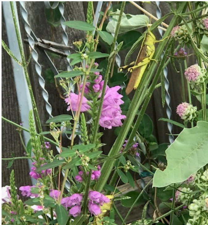
Top & Center: Beautiful bees pollinating obedient plant. Bottom: Some of our resident grasshoppers. Photos & comments from Georgia Spoonemore.