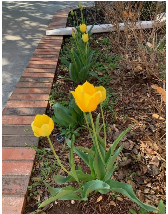
Top: Tulips are blooming ; Bottom, Left: Scabiosa is blooming away; Right: Blueberries are coming on. Photos & comments from Marie Hoover.