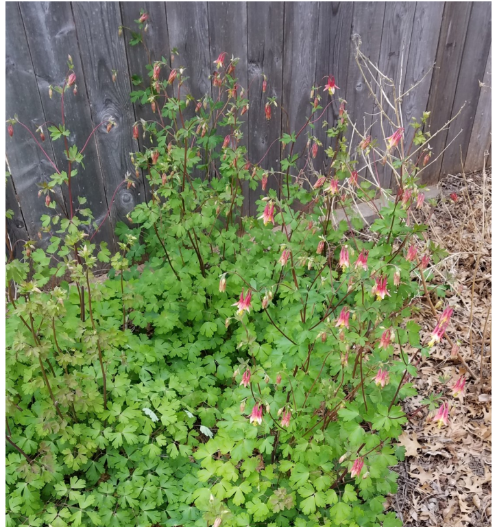
Top, Left: Hyacinth; Right: Red Columbine. Bottom, Left: Red Columbine; Right: Veronica.