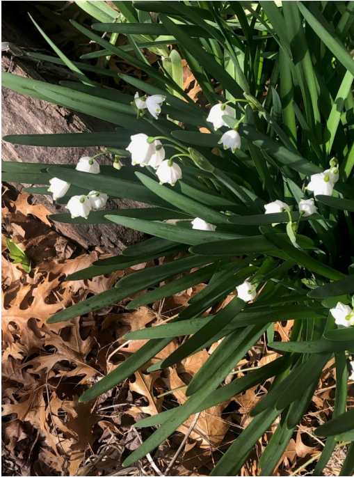
Top, Left: Lily of the Valley; Right: Quince; Bottom, Left: , Redbud; Center & Bottom, Right: Dwarf Flowering Almond.