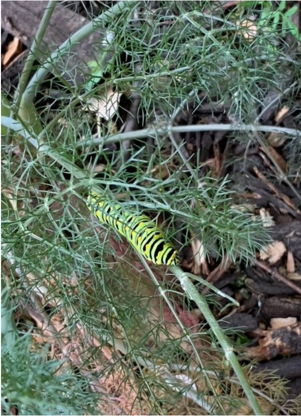
Left: Swallowtail caterpillar on fennel! Ed