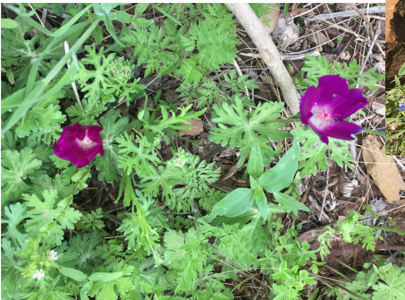
Top, left: Looks like a coreopsis—Ed. Right: Bluebonnets.