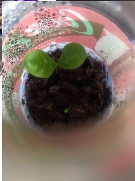
Left: Having a little fun germinating Meyer lemon seeds.