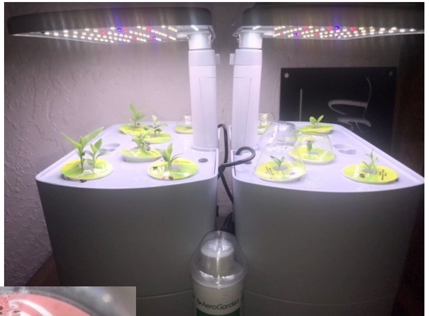
Above, Right: My hydroponic systems I pitched off of the clearance rack after Christmas. What an easy way to start seedlings. I planted some in seedling mix but they are only half the size in growth. I'm convinced this way of growing is far superior to the way I have grown before.