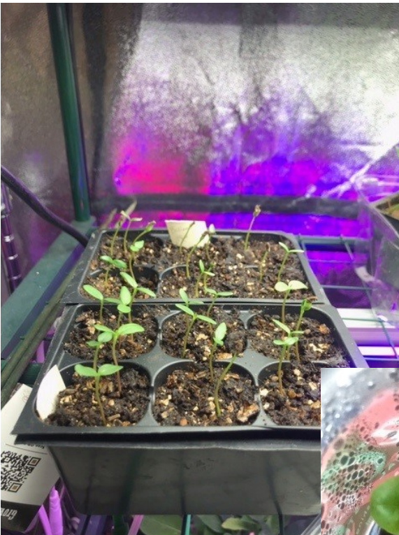
Above, Left: More milkweed coming along slowly.