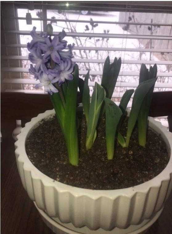
Top, Left: My hyacinth is blooming in a winter dish garden I planted to help through this cold winter. It smells heavenly!