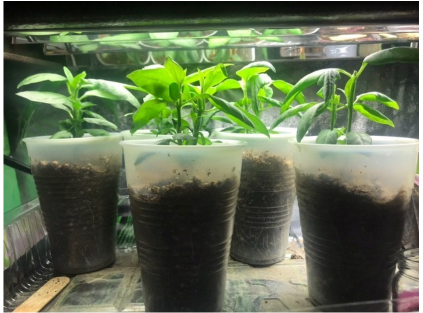
Top, Right: Milkweed I started mid January for a head start on feeding Monarch caterpillars.