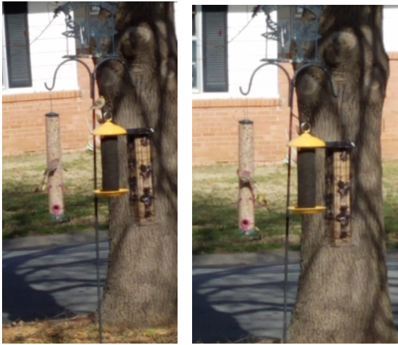
Left: The Goldfinches & House Finches were late arriving & fewer in number than usual, but it sure was good to see their bright colors! Photos & comments from Gail Elmore.