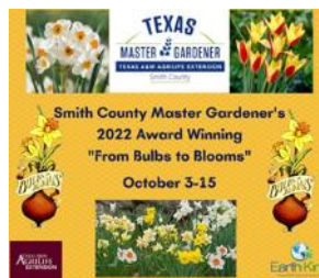
#2 October 3 11,232 people reached