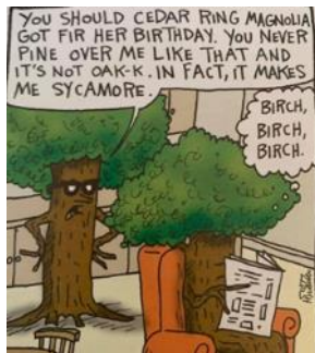
#1 October 14 12,307 people reached