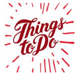
#3 October 1 5,684 people reached