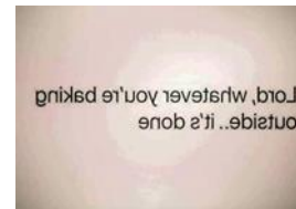
7/22 Friday Funny Reached 5,811 people