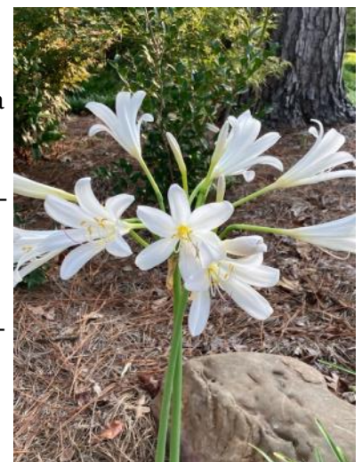
Lycoris longituba 'Long Tube Surprise Lily'