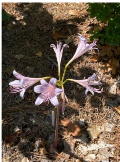
Lycoris x incarnata 'Blue Pearl.'

Things have been status quo in the Shade Garden for the month of August. We garden workers are glad for a break in the triple digits and the garden has enjoyed the gift of rain. The bed leaders are in the process of making preparations for purchasing camellias and azaleas for fall planting.