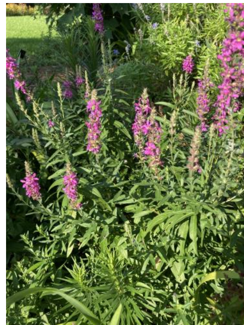
Loosestrife looking great in the heat!