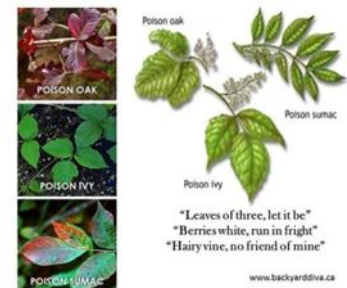
May 10 Reached 9443 people