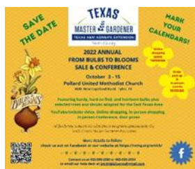
May 16 Reached 5776 people