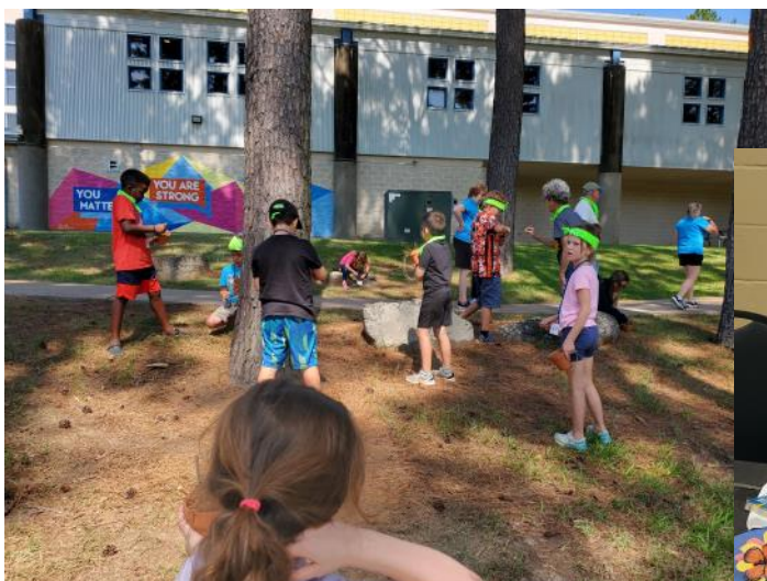
More photos from Nature Detective!