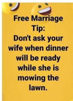
May 20 Reached 4514 people

The Top Three Facebook posts for May were: