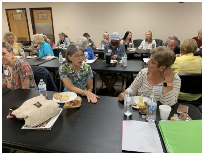
Mentors meeting their soon-to-be Interns!