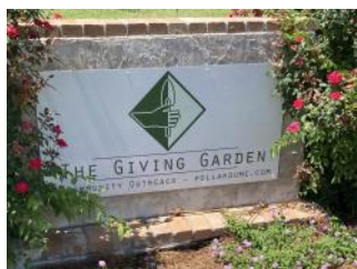
Our newest Community Garden, at Pollard UMC!