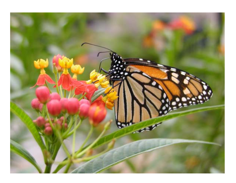
The IDEA Garden is a designated Monarch Way Station