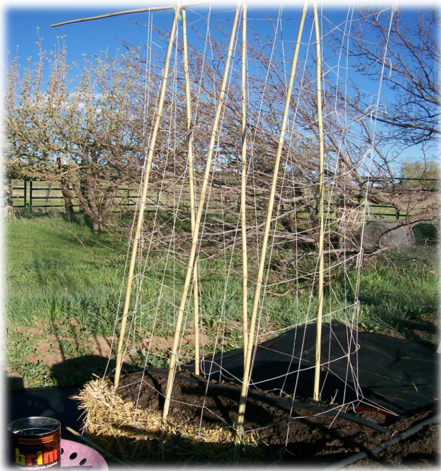
Bamboo Cucumber Trellis

Trellises are easily created for even better use of garden space.