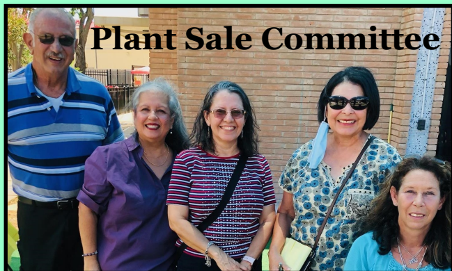
Plant Sale Committee