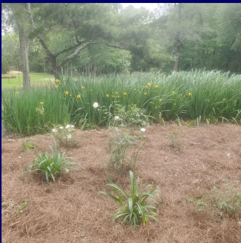
Master Gardener bed at Beaumont Botanical Gardens.