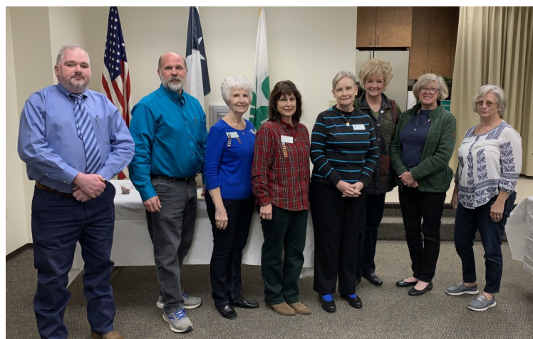
Left: 2020 JCMG Board Members