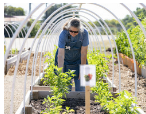
A Texas Master Gardener working on the Dallas county urban farm.

The Master Gardener program trains volunteers to increase the availability of homeowner information to the public utilizing social media, speaking events, demonstrations, phone calls and emails. There is always someone on our volunteer team to answer your questions.