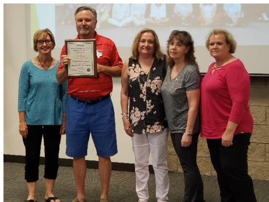
Texas Master Gardener State Conference awards the Outstanding Association Award to HCMGA. Pictured is part of the 2018 leadership team.

For Outstanding Association , HCMGA won first place. This category “recognizes a Master Gardener Association that has completed at least one or more programs and/or projects of importance to the community”. HCMGA has an ornamental demonstration garden, a soon-to-be-completed fruit and vegetable demonstration garden, and offers numerous educational programs, including the popular “Learn at the Library Series” given free to the public every month.