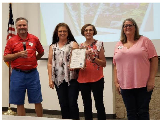
Texas Master Gardener State Conference awards the Written Education Award to HCMGA's 2018 Interns with for their HCMGA's Monthly Gardener Guide. Pictured are some of the Interns who developed the guide.

HCMGA's Monthly Gardener Guide was awarded second place