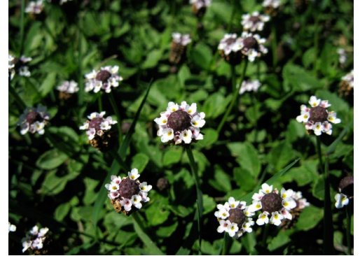
Frogfruit

Q. What are some top tips of how to properly care for most natives “after the sale,” i.e., good maintenance advice? Also, any key inadvertent mistakes to try to avoid?