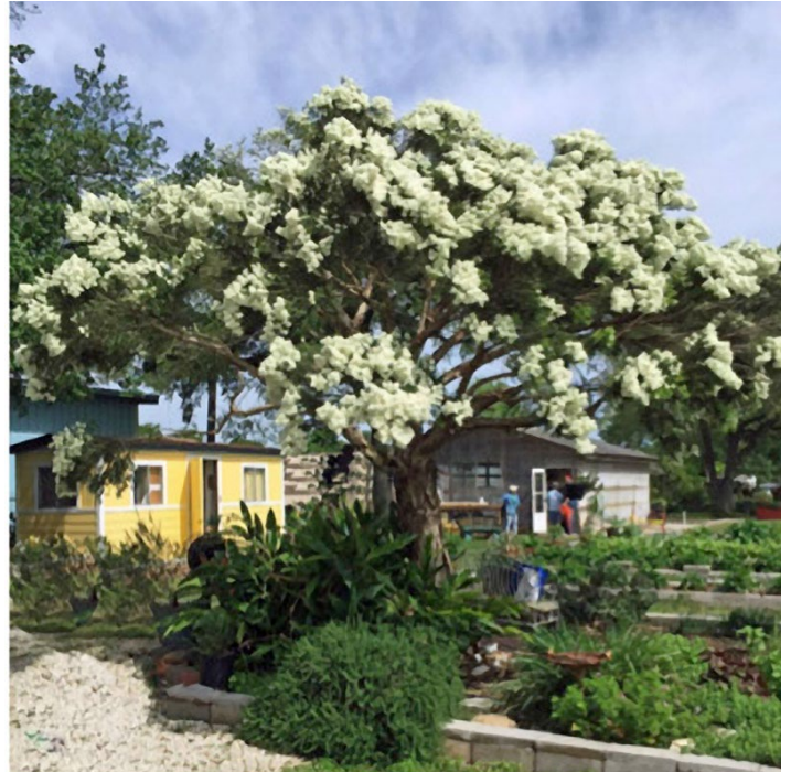
Tea Tree in bloom at Genoa Friendship Gardens

Melaleucas range in size from shrubs of only a few feet tall to trees reaching up to 100 feet, and all are evergreen with aromatic leaves. They're found in a wide variety of habitats, from swamps and boggy places to poor, sandy soil. The familiar Bottlebrush tree also belongs to the myrtle family in the genus Callistemon , and its red flowers resemble those of Melaleuca lateritia , M. hypericifolia and others.