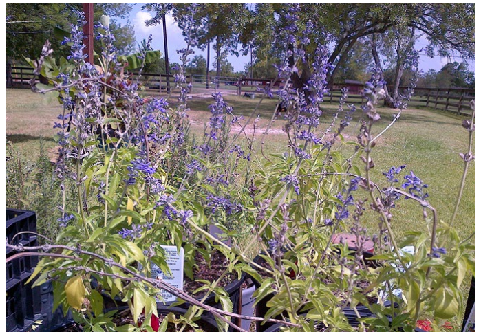
Henry Duelberg salvia is listed as a Texas Superstar®