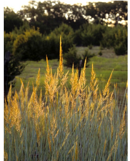
Indiangrass - photo by Sally and Andy Wasowski, Lady Bird Johnson Wildflower Center

As far as aesthetics go, lots of natives are showy, such as the Coneflowers - the Rudbeckia and Echinacea genera. Our most common local native Echinacea, Sanguine Coneflower, is not as large as some from other areas or as cultivars, but it is the right one for our area. It is simple and lovely, and the fact that we can claim it as ours makes it beautiful. Beauty is in the eye of beholder and sometimes we need to adjust what we appreciate in a plant.