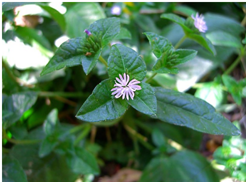
Carolina Elephantsfoot

Everyone needs to read about the requirements of each plant so that they get the plants that are right for their gardens, particularly when it comes to plants that require full sun. Those are the ones that may struggle the most if that condition is not met.