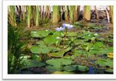
The Water Garden