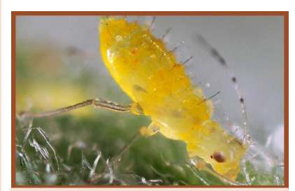
Makes gallons of honeydew

Aphids, also known as the "lice of plants," can do lots of damage to many numbers of plants. But they can also leave a mess behind, known as honeydew. If plants, patio furniture, or just about anything left outside is covered with a sticky substance; check for aphids and their trail of stickiness.