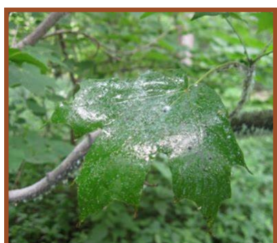
Aphid Honeydew on Plants

A fungus called "sooty mold" colonizes honeydew-covered surfaces, causing them to be covered with a black coating. As a result, sunlight cannot reach the leaf surface, which restricts sunlight, making it unable to reach the leaf surface, which limits photosynthesis which produces the plant sugars. Honeydew-covered surfaces, including car exteriors, decks, and sidewalks, become sticky and blackened with sooty mold.