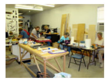
Card making workshop