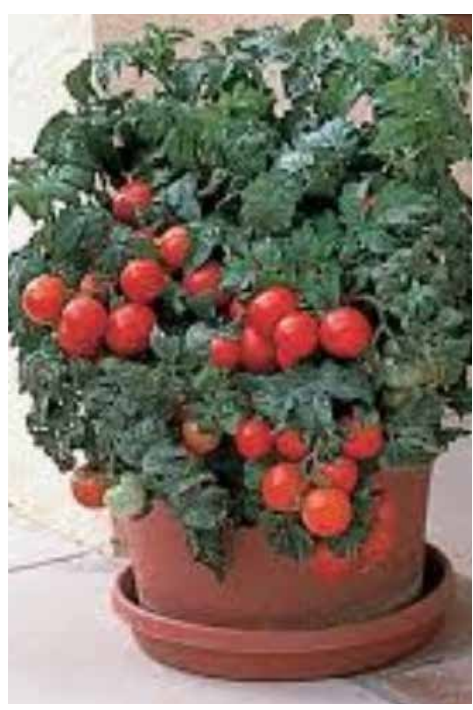
Tomatoes in container GCMG database