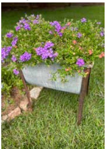
Wash tub with flowers