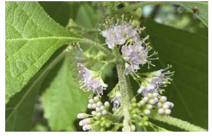
Beautyberry Blooms.

University \ of \ Florida/IFAS \ Extension - \underline{https://edis.ifas.ufl.edu/publication/FP090}