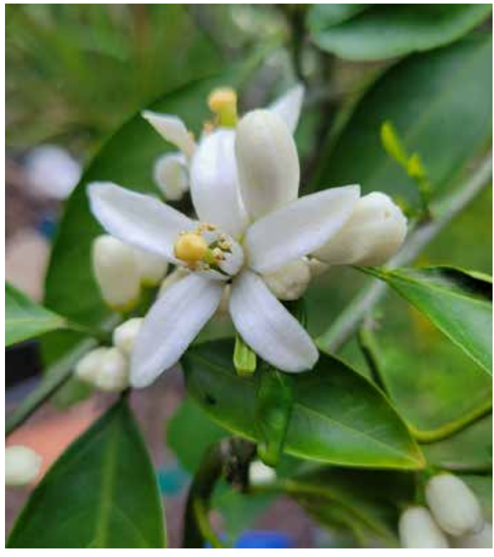
Blooms