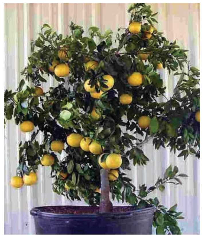
Dwarf citrus in a pot. GCMG Database

Commercial soil-less media blended for citrus provides good