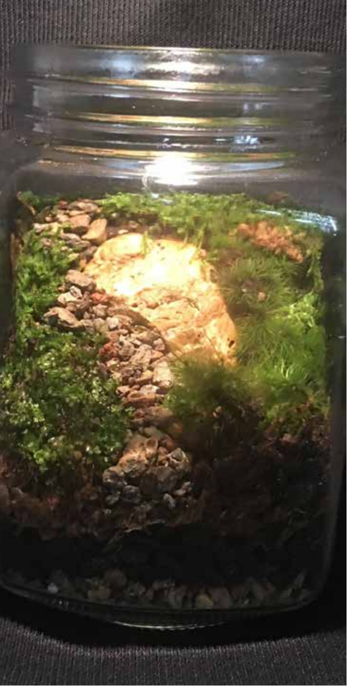
MG Donna Ward

elements that please you. The porous nature of volcanic/lava rock gives the moss something to grab onto, as propagation is easier on a rough surface than on a smooth surface. A hard-scape isn't necessary, but if you want that 'wow' factor, it's essential.