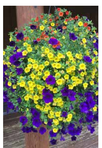
Splashes of color MG Karolyn Gephart

After being satisfied that you have adequately lined the basket with moss, you can fill the cavity with your favorite soil mix. As a rule, about twelve 3-inch pots should be used in a 16-inch basket. About fifteen 3- inch pots will be sufficient in a 20- inch basket.