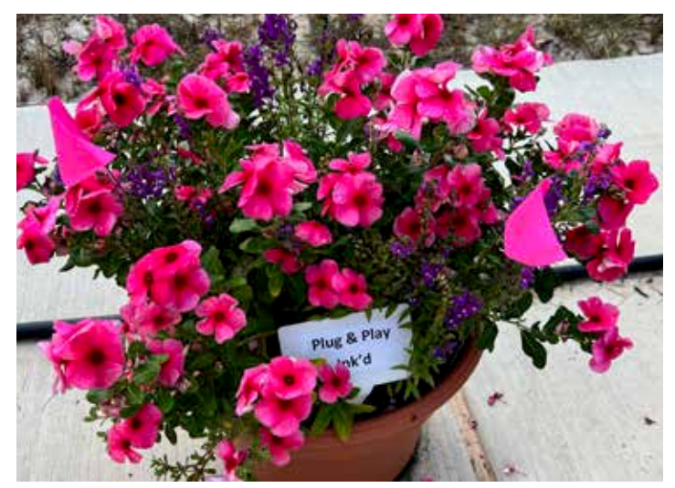
Plug and Play Ink'd