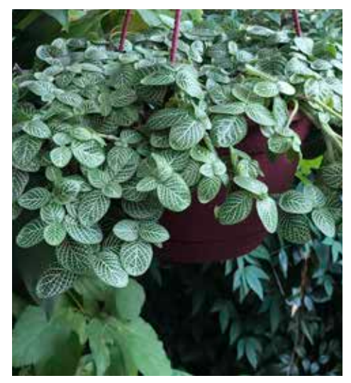
Mosaic plant (Fittonia albivenis) looks great in a basket.