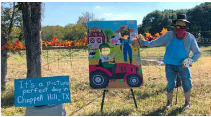
Stephanie Ddughdhnemimnier, Chappell Hill 2022 Scarecrow Contest

The effectiveness of scarecrows depends on the species of birds. For example, crows and blackbirds are undoubtedly scared off by scarecrows, but pigeons and seagulls are not as easily frightened. In general, scarecrows work best when used in combination with other bird deterrents. Other birds are attracted to cultivated foodstuffs, including doves, blackbirds, grackles, sparrows, turkeys and quail, and are drawn to the fresh seeds as well as the nutrients used to fertilize the young plants. As the fowl scavenge in the garden, they will seek the nuts, worms, baby moths or beetles that subsist in the top layers of soil. Crows are particularly harmful though as they hunt in flocks effecting great damage and destruction of crops.