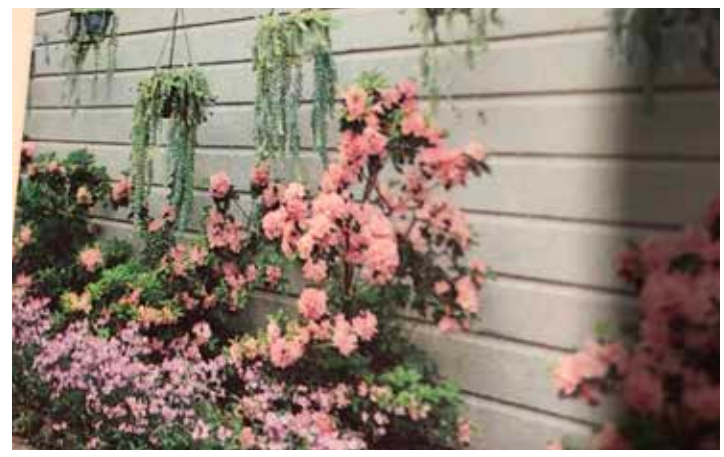
Succulents do well in baskets. MG Elayne Kouzounis

Watering and fertilizing procedures are the most important considerations for maintenance to maintain the quality of the plants.