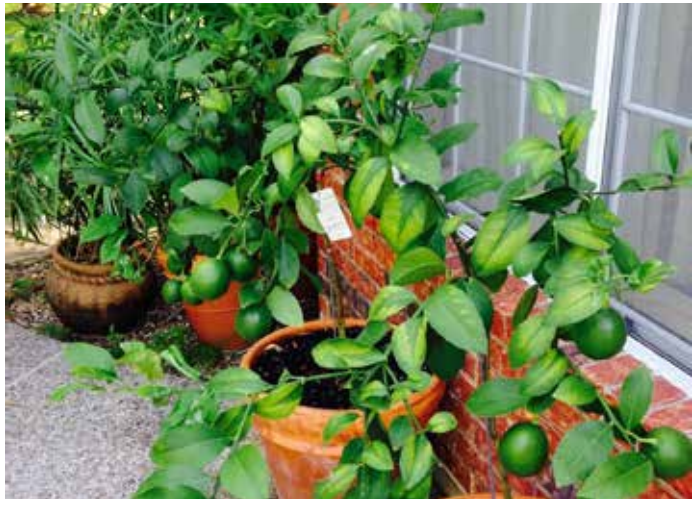
Container citrus MG Elayne Kouzounis