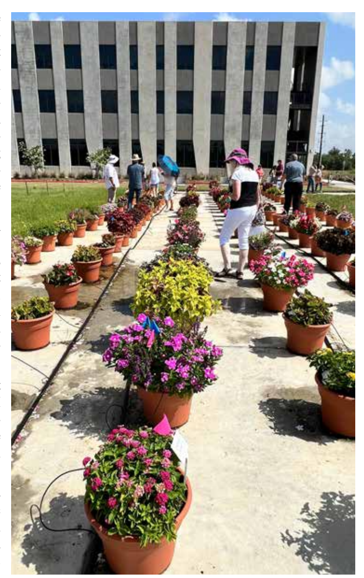
Exploring the samples