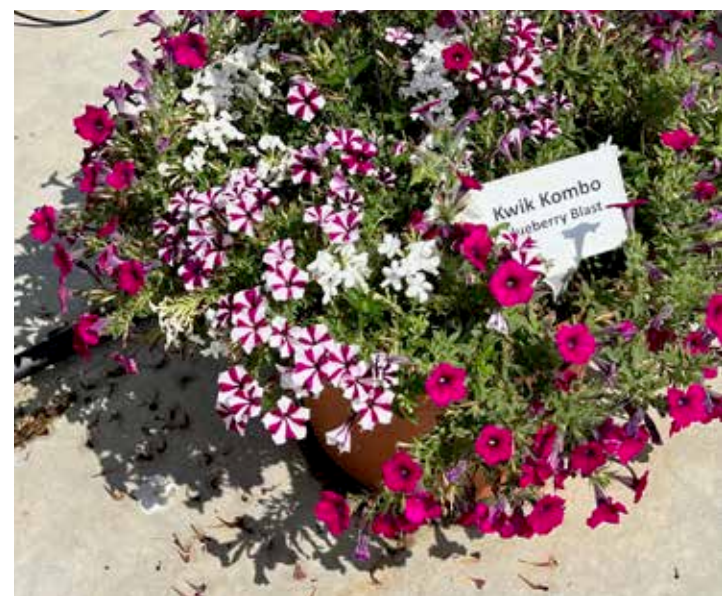
Kwik Kombo Blueberry Blast

Brand names appearing in this article are for product identification purposes only. No endorsement is intended nor criticism implied of similar products not mentioned.