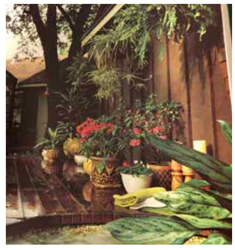
Texas Superstar® geranium baskets. (tamu.edu)