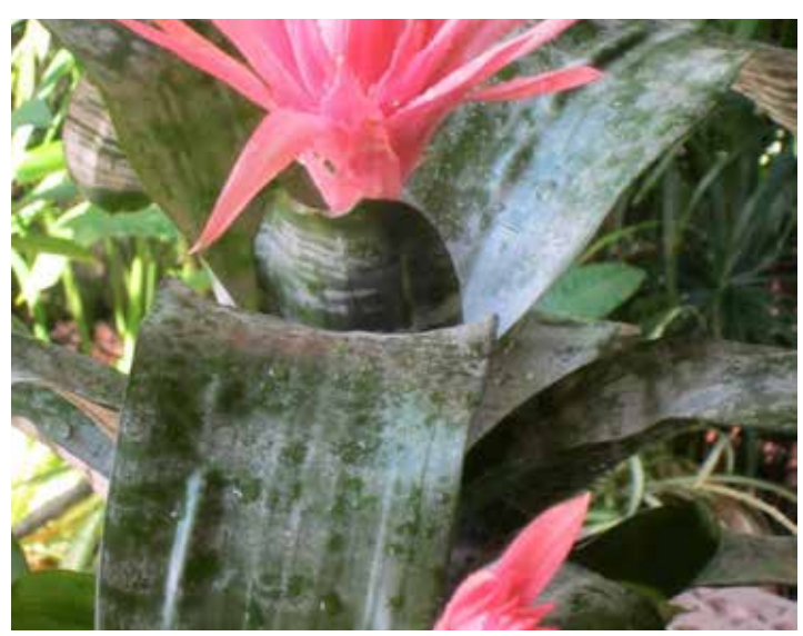
Bromeliads flourish in our high humidity

A seating area on the patio for everyone to enjoy