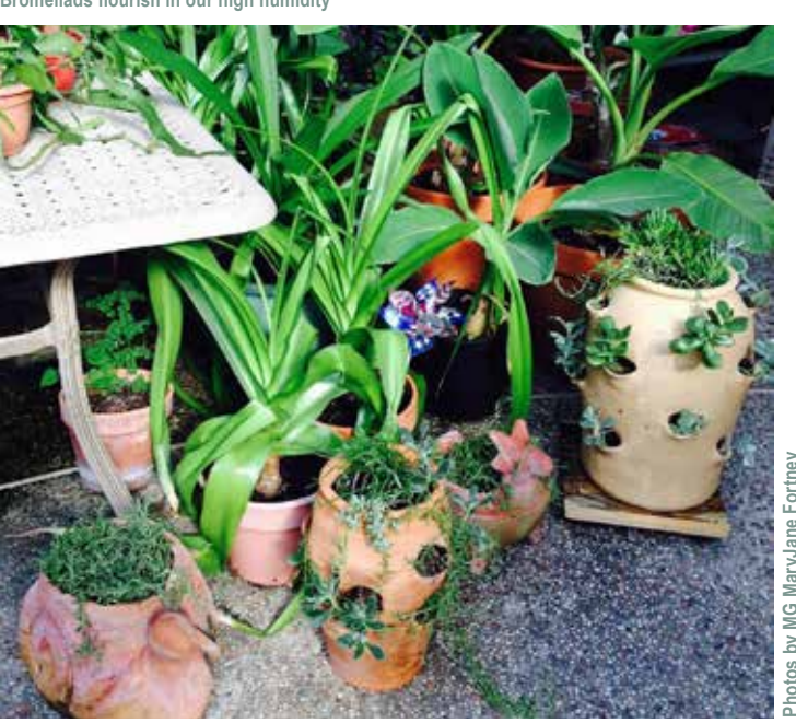
Various containers and a variety of plants