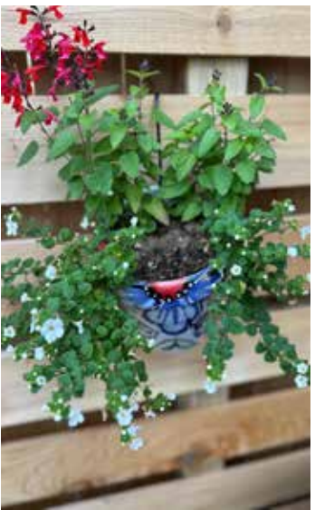
Flowers in glazed ceramic

\frac{https://extension.wsu.edu/king/tip-sheet-6-container-gardening/\#:\sim:tex-t=Almost%20any%20container%20with%20adequate,growing%20spaces%20than%20small%20plants}