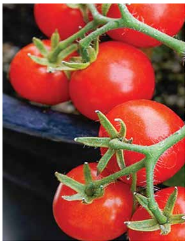
Little Birdie Red Robin

Fun, easy and tasty. Yes, I plan to grow some again.