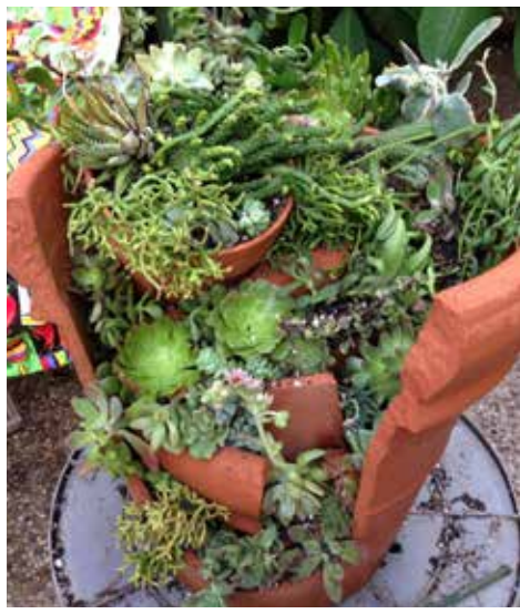
A succulent garden container re-using broken pot pieces