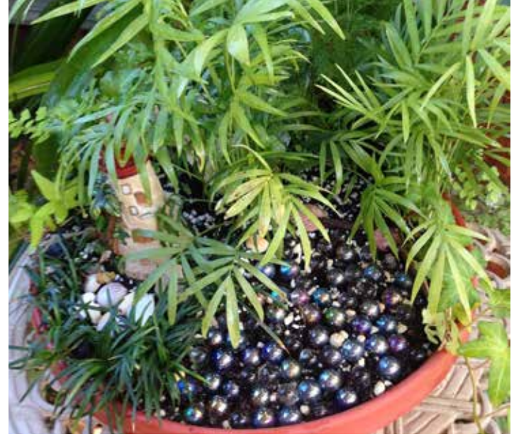
A dish garden made of a variety of small plants and reused container and contents around the house