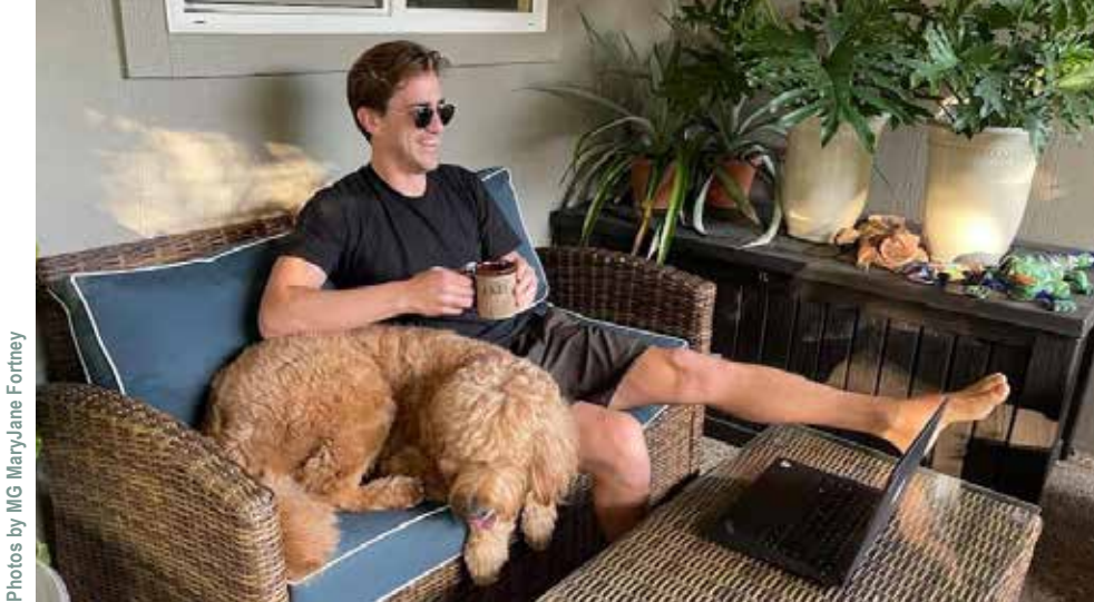
A seating area on the patio for everyone to enjoy

For most container gardens, the windowsill is the most natural first step. The pleasure of a window box can be enjoyed from both inside and outside. Most window boxes placed on