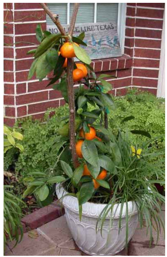
Citrus as the thriller GCMG Database