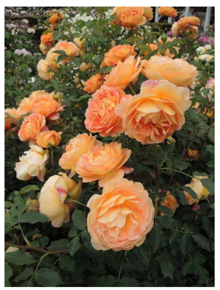
Golden Celebration