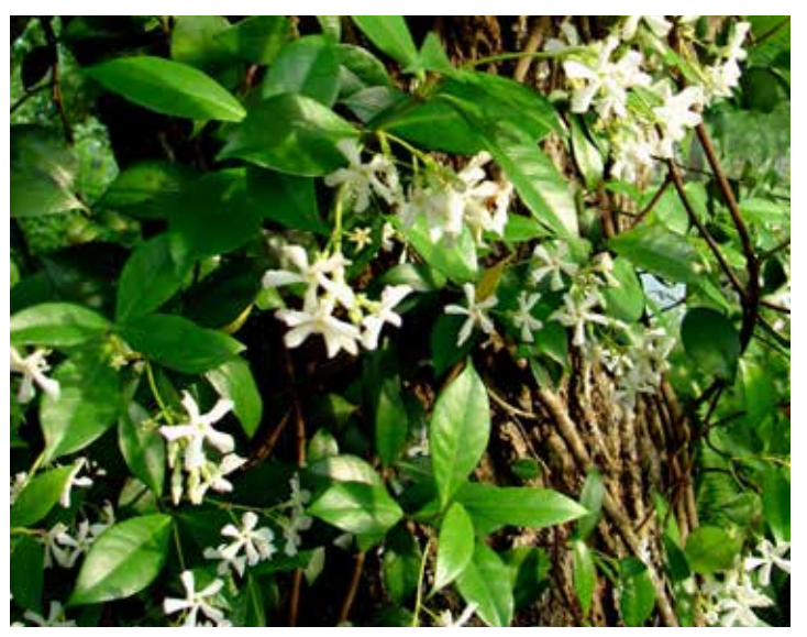
Confederate Star Jasmine