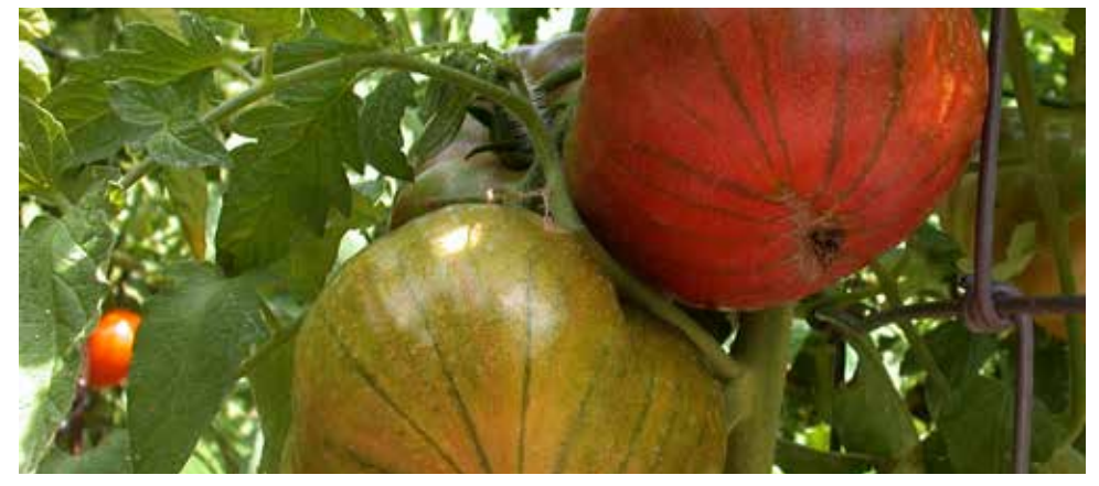
Heirloom Tomatoes - MG Terry Cuclis

The main appeal of heirloom tomatoes is their taste—they are eating tomatoes, pure and simple. An interesting aspect of heirloom tomatoes is their color, a rainbow spectrum including stripes and blushes. Each one is different—some are meatier, some have fewer seeds and some taste a bit salty or spicy. Heirlooms can be found in a variety of colors, shapes, flavors and sizes.