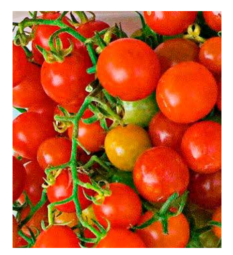
Red Currant Tomatoes

This is a tomato that is in a category all its own! These, the tiniest tomatoes grow perfectly round, are bright red and are often called "cute". The "Red Currants" will produce hundreds of tiny tomatoes (about the size of a blueberry) that boast an overall good taste that is not too sweet but just right. Currants will continue to grow until frost but may continue to produce if the weather is mild. They will need staking or caging for support. Red Currants are great on salads but are best when you pop them into your mouth, one tasty tomato at a time!