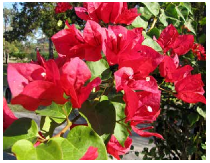
Bougainvillea