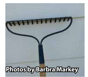
Landscape or Bow Rake

oday we will discuss different types of garden rakes and their usage. Some languages define the word rake to mean "heap up or scrape together." Think of the rake as an outdoor broom with a variety of uses.