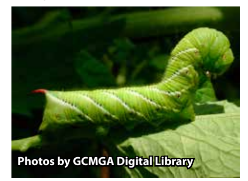
Tobacco Hornworm (larva)

The tobacco hornworm larva is green in color with L-shaped stripes and a red "horn" appendage at its rear. It has an appetite to match its large size (nearly four inches at maturity). The tobacco hornworm can strip a tomato plant of its leaves and new stems rapidly. Although it prefers the tomatoes in your garden, the hornworm will also make a lunch of eggplant, potatoes and peppers. The tobacco hornworm is the larvae stage of an adult sphinx moth. The moth lays its eggs on the underside of tomato leaves in the spring—the eggs take about a week to hatch and the resulting larva will feast on your plants to maturity which takes two to four weeks. At that time the worms will burrow into the soil to pupate. Shortly a new moth will emerge from the soil to lay another series of eggs. Each moth may lay up to 2,000 eggs! The hornworms are easiest to spot in the morning and in small gardens the best control is removal and disposal although sevin or malathion products as well as applications of Bacillus thuringiensis , sold as Dipel or Bio Worm Killer will help control and prevent outbreaks.