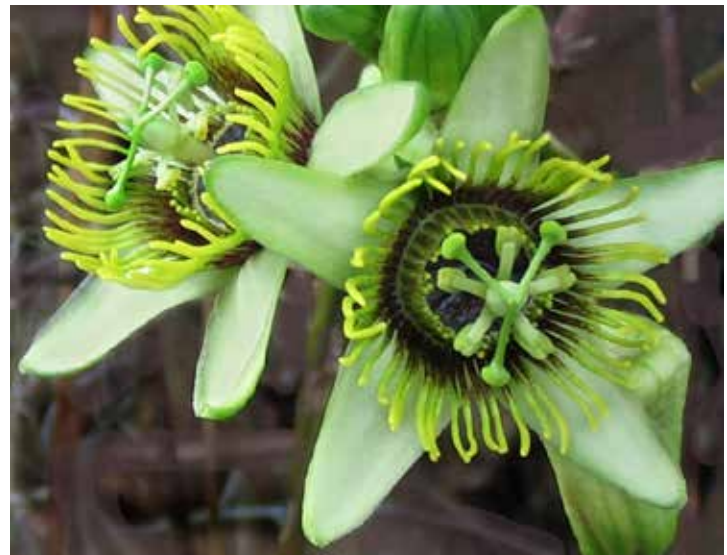
Passionflower