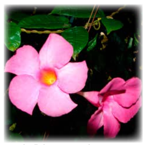
Mandevilla

Other flowering vines which perform well in Zones 8/9 include Sweet Autumn Clematis Clematis temiflora , Black-Eyed Susan Thunbergia alata , Mandevilla Mandev illa splendens , Hyacinth Bean Vine Dolichos lablab , and Trumpet Vine Campsis radieans . All of the vines discussed above may also be grown in containers and as a ground cover. In addition, their trailing, branching habit makes them good candidates for hanging baskets. While all vines, especially flowering vines, require some pruning to keep them in check and a bit of care, the rewards are worth the "blooming" effort.