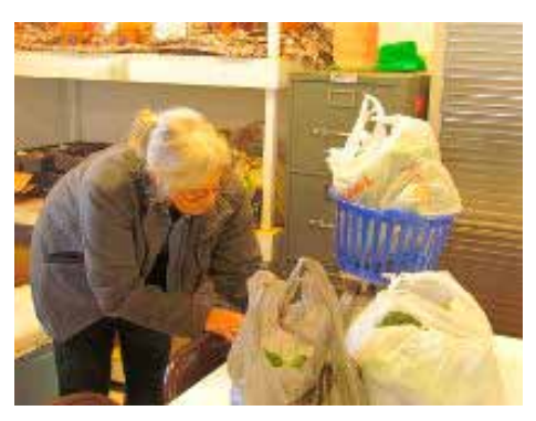
That's me weighing the broccoli and recording the weights before writing on the board