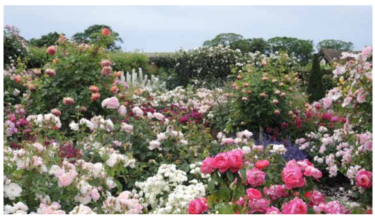
Garden Overlook

YouTube Video Title – "A Visit to an English Rose Garden: The David Austin Garden Center" - Video Link: <u>https://www.youtube.</u> <u>com/watch?v=v]XnsPHBh-U</u>