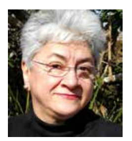
by Sandra Gervais MG 2011