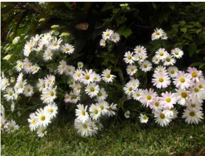
Chrysanthemum ( Chrysanthemum x morifolium syn: Dendranthema x grandiflorum ) by GCMG Digital Library