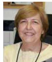
By Sandra Devall MG 1998

F all color in our Texas Upper Gulf Coast growing region is not famous for spectacular displays of fall foliage among our trees. Our trade off for this seasonal attribute in more northern landscapes is that our winter seasons are typically mild and subtropical. While in most years most of our landscape tree may forego colorful changes as the fall season progresses, our landscapes can still be full of color in November and December when you consider the number of plants that have color because they bloom throughout our mild winters.