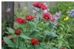
Cover: Our landscapes can still be full of color in November and December