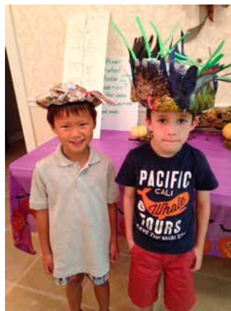
Two Junior Master Gardeners