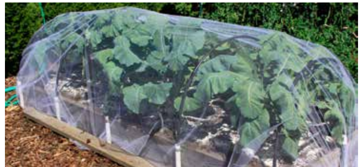
Have protective covers ready

DO have a Happy Thanksgiving, DO have a very Merry Christmas, and DO have a prolific gardening New Year!