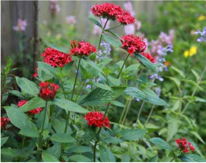
Pentas ( Pentas lanceolata ) by MG Tabatha Holt