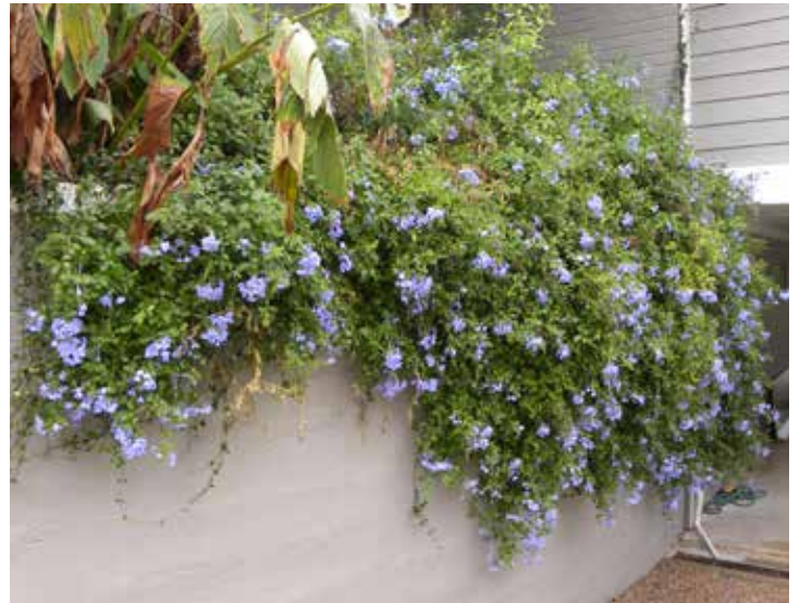
Plumbago ( Plumbago auriculata ) by GCMG Digital Library