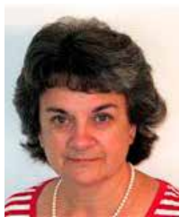
By Camille Goodwin MG 2008