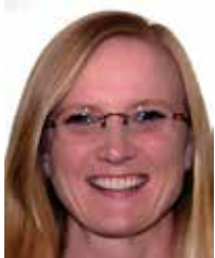
By Genevieve Benson MG 2015 Intern