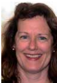
By Sandy Zeek MG Intern 2015