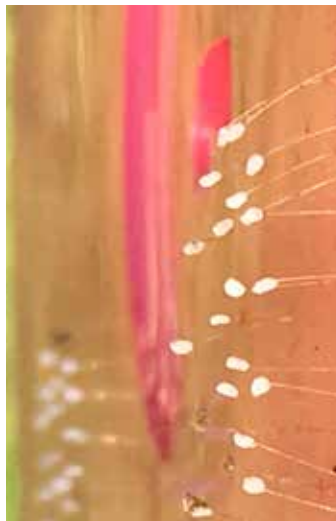
Side view of eggs on my hummingbird feeder