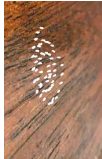
Eggs on my front door