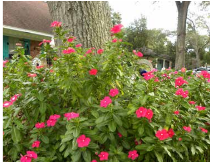
Periwinkles ( Vinca sp.)