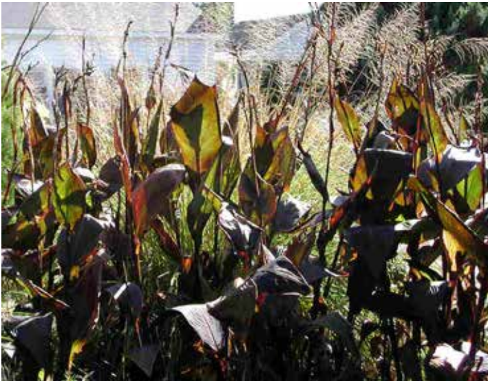
Canna ( Canna x genralis )