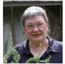
By Donna J. Ward MG 1996

(Editor's Note: This is a reprint of Donna's article for La Ventana del Lago , the City of El Lago's newspaper).