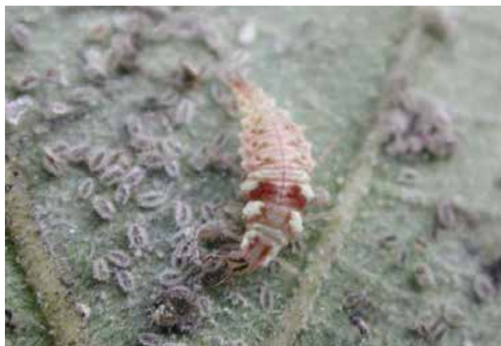
Green Lacewing Larvae