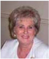
By Kaye Corey MG 2001