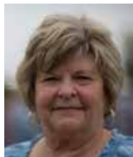
By Barbra Markey MG 2013