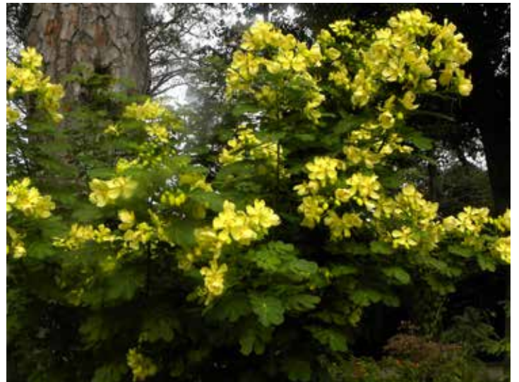
Cassia ( Cassia bicapsularis )