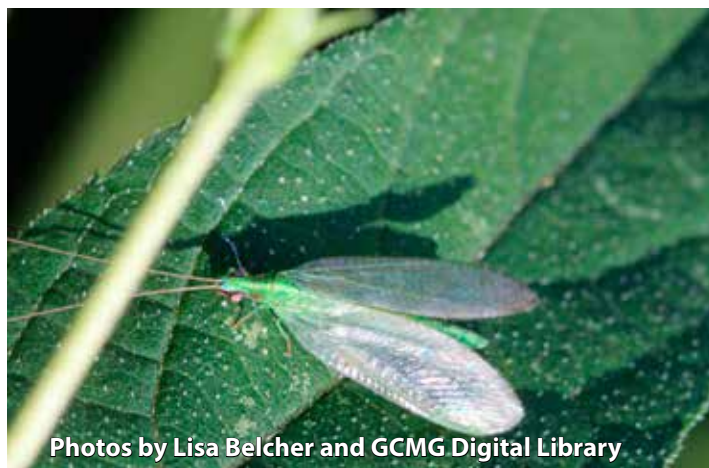
Green Lacewing Adult

Photos by Lisa Belcher and GCMG Digital Library