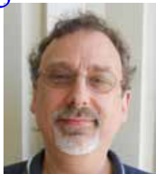
by Gregory Werth MG 2012