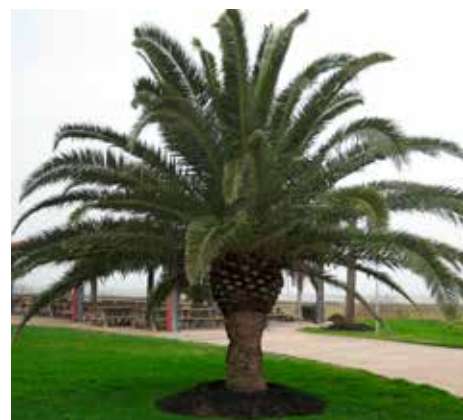
Canary Island Date Palm