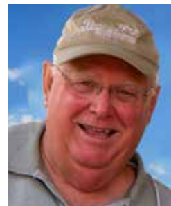
By Ira Gervais MG 2011

W e grow tomatoes from seed because we can choose our varieties, we can get the seedling when we need them and we can watch them grow from the packet to our table. Most of all, everyone knows that home grown tomatoes just taste better!