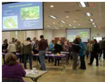
Quite a Crowd