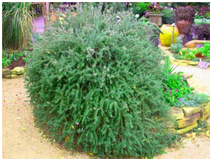
R. officinalis prostrate (creeping variety)