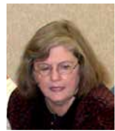
By Mona Ray MG 1987