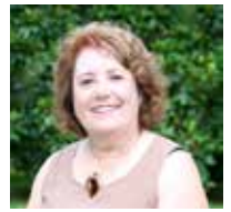
By Jan Brick MG 2001

(Editor's Note: This is a reprint from Jan's article in "The Islander" magazine.)