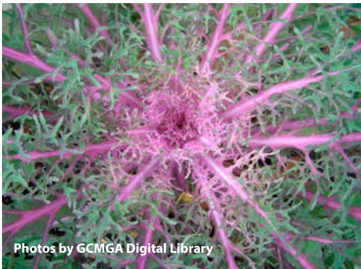
Red Peacock Kale

"Plants like to boast their best feature. For some, color is their vanity; for others, it's distinctive texture or form. Flowering kale and cabbage ( Brassica oleracea ) happily package all three traits. Their plump roundness boldly complements sprawling pansies and the slender leaves of emerging spring bulbs. Ruffled and ribbed foliage in vivid shades of blue-green, rose, red, purple and creamy white adds sparkle to shimmering silvers and grays. By contrast, yellows and pinks take on a crisp brightness. With their long lasting color, symmetry, and ruffled or crinkled edges, it's no wonder that flowering kale and cabbage have become so popular. Try some this year for a living rainbow to warm up a frosty and cloudy day."