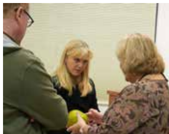
Identifying a Fruit