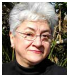
by Sandra Gervais MG 2011