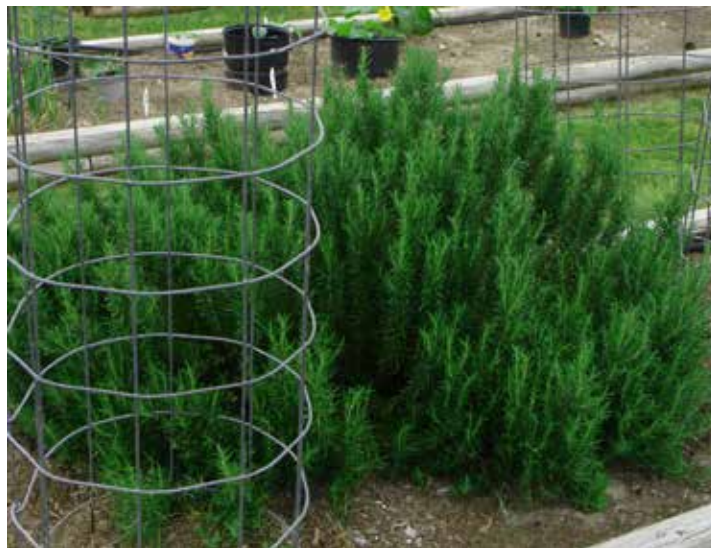
Rosmarinis officinalis (upright variety)

Grow our versatile friend in full sun and enjoy its delicious beauty. Then share a sprig of your thriving shrub with a friend to root or to enjoy in recipes.