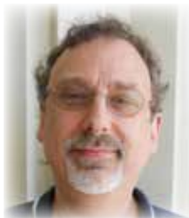
by Gregory Werth MG 2012