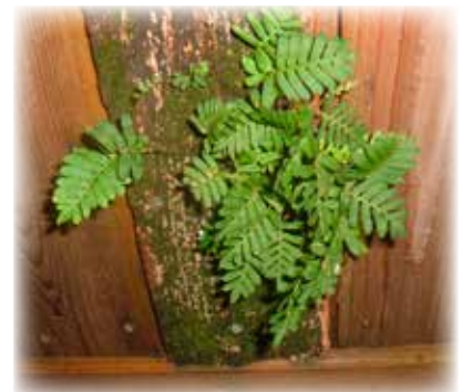
Selaginella lepidophylla ,