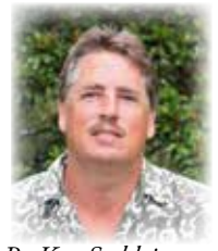
By Ken Steblein MG 1992

G ardeners are very creative in figuring out different ways to maximize their garden's potential by using less ground space and growing their plants vertically. There are many advantages to keeping plants off the ground because it often increases plant yields, reduces plant diseases by lifting the plant foliage off the damp ground and improves air circulation. Supported plants are easier to monitor for insects plus birds feel safer to perch and hunt for six-legged pests (i.e., insects) when the plants are off the ground. Food crops are easier to monitor at eye level and some fruits and vegetables become perfect in shape and color from not laying on the soil. Many times you can use vertical gardens to screen things, draw your eye to a focal point or create an arch to take you from one garden to another.