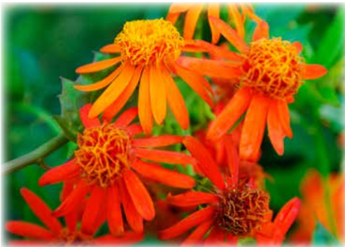
Mexican Flame Vine