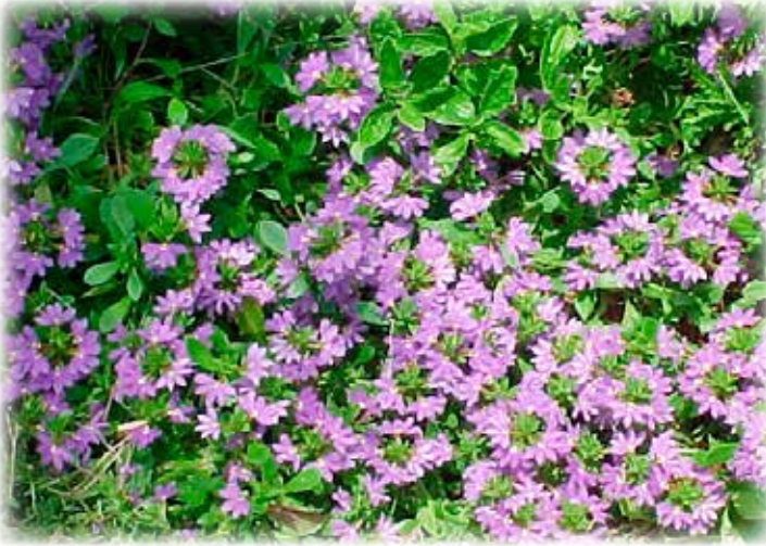
Aster Climbing Caroline