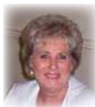
By Kaye Corey MG 2002