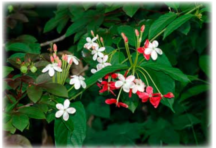
Rangoon Creeper by MG Judithe Savely