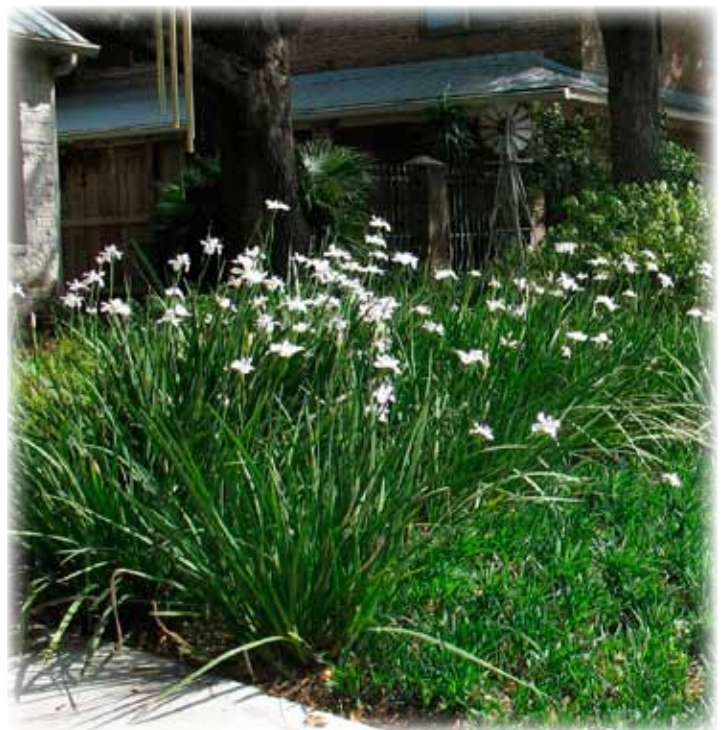
Lawn Reduction