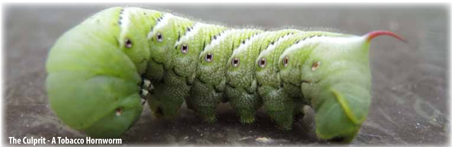
The Culprit - A Tobacco Hornworm