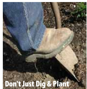
Don't Just Dig & Plant