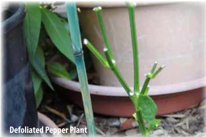
Defoliated Pepper Plant

It is suggested that you “dispose” of these crop-damaging eating machine caterpillars and spray your plants with Bt ( Bacillus thuringiensis ) to prevent other caterpillars from eating your peppers and tomatoes. I did not have the spray and I could not bring myself to “dispose” of him, so I released him in the middle of Clear City Lake Blvd to let him find someone else’s pepper and tomato plants to eat.