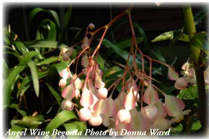
Angel Wing Begonia