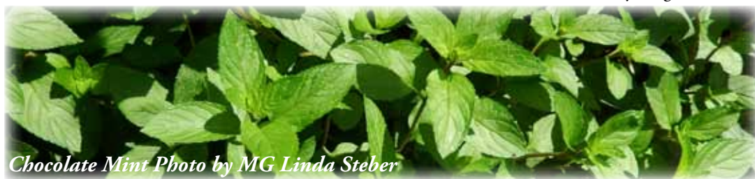
Chocolate Mint

“Chocolate Dreams”—mahogany blooms with chocolate brown veining and ruffled edges