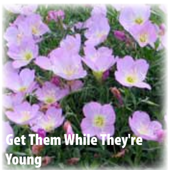
Get Them While They're Young

I. Adding topsoil? Watch for weeds! Most gardeners need to do this on occasion. BUT... where did that garden soil mix come from? A visit to a soil yard can be well worth the time and effort. If a soil yard already has an impressive crop of weeds in residence—beware about purchasing soil from that soil yard. Even a high-quality soil mix can be expected have its own blend of weed seeds mixed in so you might get some weeds you never saw before. Just be sure to keep a vigilant watch for what comes up in it and to get rid of it as soon as you can—before it spreads to the rest of your landscape.