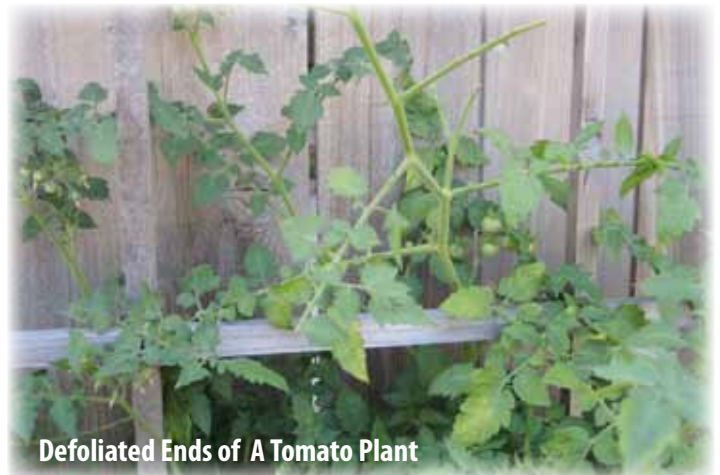
Defoliated Ends of A Tomato Plant