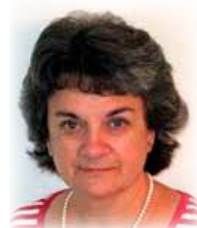
By Camille Goodwin MG 2008

"Spring being a tough act to follow, God created June." - Al Bernstein