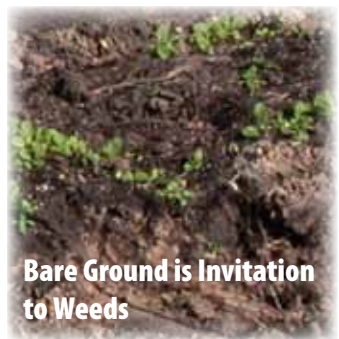
Bare Ground is Invitation to Weeds