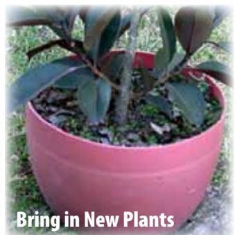
Bring in New Plants