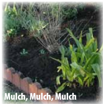
Mulch, Mulch, Mulch

X. Yes to composting and no to recycling weed seeds. Be prudent about use of weeds for composting. Never place weeds that have flowered or already set seed in the compost. Composting is certainly a good thing but it takes a hot compost pile of approximately 150-160 degrees to kill weed seeds. If you cold compost, do not put weeds in it.