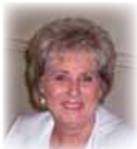
by Kaye Corey MG 2002