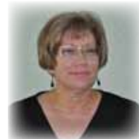
By Karen Cureton MG 2008