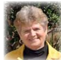
By Pat Forke MG 2010

It is critically important that we create, conserve and protect milkweed/monarch habitats. If you do not already have milkweed in your landscape, consider adding this very important plant. You will be rewarded as you watch these beautiful monarchs flutter around your landscape. Be sure when you make your butterfly garden that you eliminate the use of insecticides, mulch around the base of plants to reduce the growth of weeds and retain water, remove invasive species from the site and use natural compost for fertilization. Consider making your butterfly garden a Monarch Way Station. For more information, see http://www.monarchwatch.org/waystations/