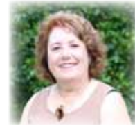
By Jan Brick MG 2001

Do you love chocolate—the color—the smell—the taste? Then consider planting some chocolate in your garden!