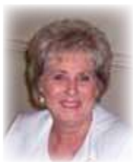
By Kaye Corey MG 2002