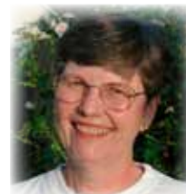
By Anna Wygrys MG 1993

The best moisture for a garden is your sweat, and the best weed control is your hand. Then, may all the weeds that grow in your garden be wildflowers - Anna