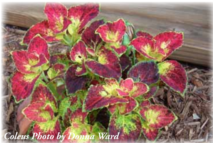
Coleus