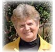
By Pat Forke MG 2010

T he highest order of plants and an important part of our landscape, trees are a source of habitat and food for many living organisms, increase the value of your property and are a visual asset to your neighborhood. By shading your home from the summer sun, trees help to lessen your air-conditioning expenses. Deciduous trees (those that drop their leaves in the fall), planted on the south or west side of your home, can reduce your air-conditioning expenses by as much as 20-25% during the hottest months of summer. And, when the leaves begin to fall, the winter sun's rays will warm your home.