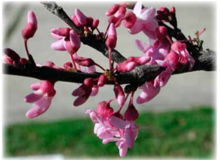
Redbuds in Bloom

Goldenrods, dogweeds, chickweed, clover, and other low plants.