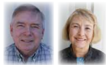
By Tom Fountain MG 2008 By Jan Fountain MG 2012 Intern

Over the past few weeks, the days have become shorter, and the mornings cooler in the garden. The MGs finished putting in fall crops which have been flourishing over the past month. Leaves on the trees and bushes around the garden have started turning reds and yellows in anticipation of the changing season.