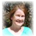
By Cindy Croft MG 2009

The following are Galveston County Master Gardeners who will be giving local presentations. Please show your support by attending if you are interested in the topic and able to do so.