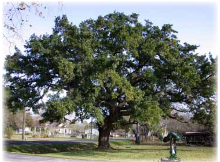
A Mighty Oak

To view the video on the moving of the Ghirardi Compton Oak in League City http://leaguecity.com/index.aspx?nid=1806