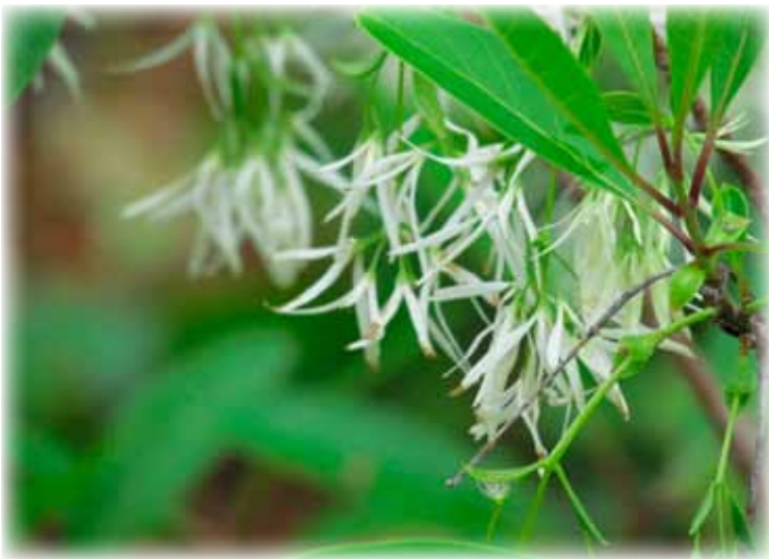
Mexican Orchid Tree from the MG Digital Library