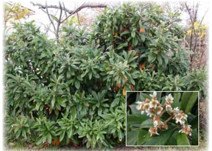
Loquat from The MG Digital Library