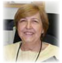
by Sandra Devall MG 1998

H ave you noticed that some front yards in the newer subdivisions are starting a fad? There are two Live Oak trees in these 30' x 60' front yards. These trees look fine right now. The problem will be when they become mature oaks and are 50 feet tall and 100 feet wide. There will be no room for them without causing roof, foundation or driveway damage. I have a large backyard, but after many years and many hurricanes, all of its wonderful large trees are gone. I began planting medium size trees and now have many of the ones shown in the best shots as well as easy to care varieties of fruit trees. These will grow between 15 to 25 feet tall. They will shade, flower and fruit! Problem solved!