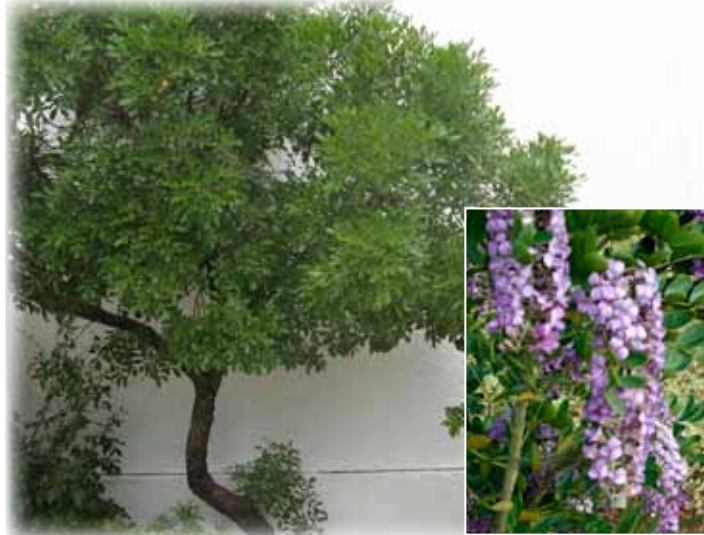
Texas Mountain Laurel