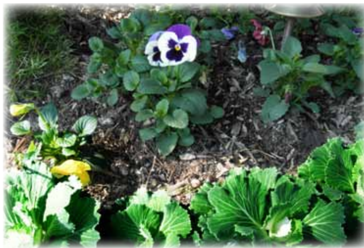
Ornamental Kale and Pansies