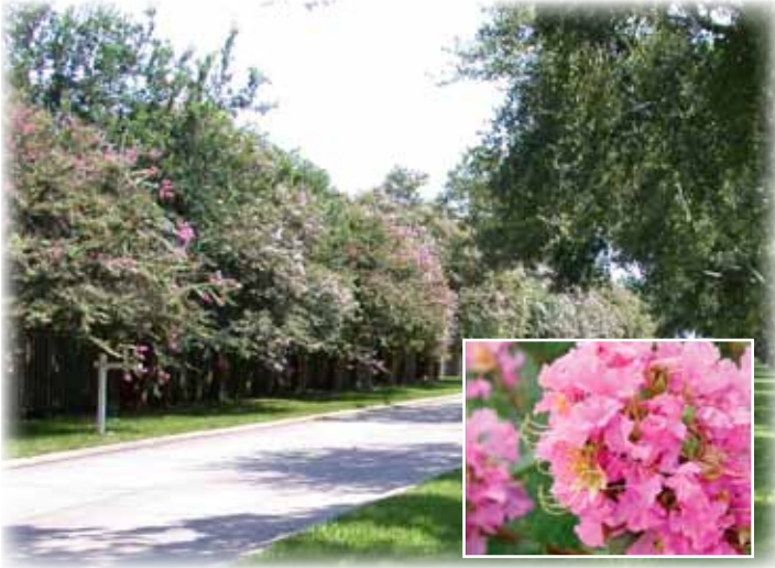
Crape Myrtle by Cheryl Armstrong