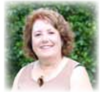
By Jan Brick MG 2001

(Editor's Note: This is a reprint from Jan's article in "The Islander" magazine.)