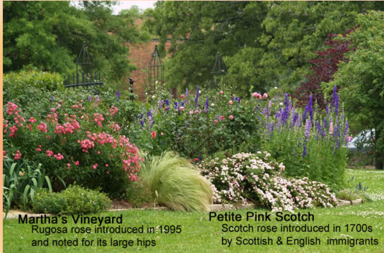
Martha's Vineyard Rugosa rose introduced in 1995 and noted for its large hips