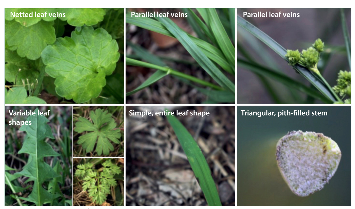
Figure 4. Various leaf shapes (left, broadleaf; middle, grass; right, sedge)