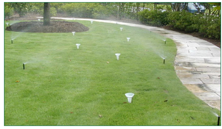
Figure 2. Irrigation audit being performed in a home lawn

Another method, which uses water responsibly, is to use evapotranspiration (ET) rates as a reference point for scheduling irrigation. The Texas ET network (http://texaset.tamu.edu) provides evapotranspiration rates through-