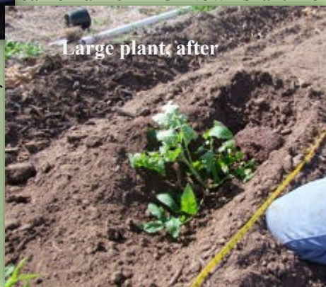
Large plant, after

chance of survival is rather low on bare-root plants this late in the season. Your best bet at this time of year is to depend on container-grown or balled-and-burlapped plants for landscape use.