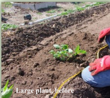
Large plant, before

☺ As camellia and azalea plants finish blooming, fertilize them with three pounds of azalea-camellia fer-