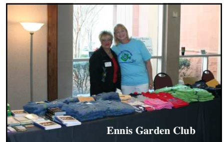
Ennis Garden Club