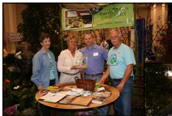
"Most Creative" EarthTones Greenery