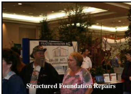
Structured Foundation Repairs