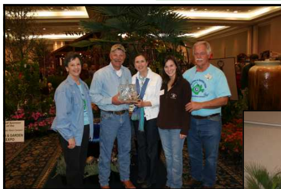
"Most Outstanding" The Greenery