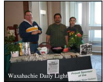
Waxahachie Daily Light