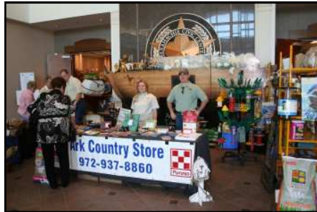
Ark Country Store 972-937-8860