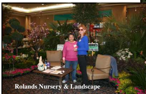
Rolands Nursery & Landscape