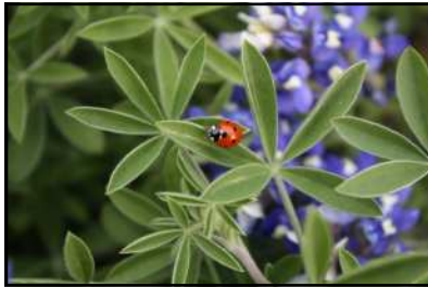
Ray Downs, Italy