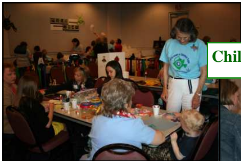
Children's Gardening Workshop

Check out our recently revamped web site at www.ecmga.com . There is lots of good material and suggestions there or call the Ellis County Master Gardeners at the Texas AgriLife Extension Office at 972-825-5175.