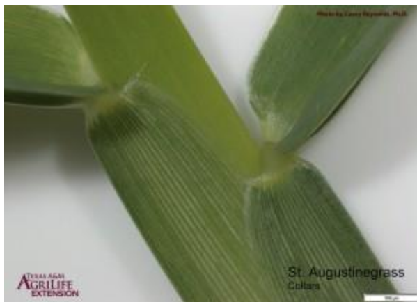
St. Augustinegrass Collars

Single application rates should range from 0.5 to 1 lb of N per 1,000 ft 2 applied during the summer growing season.