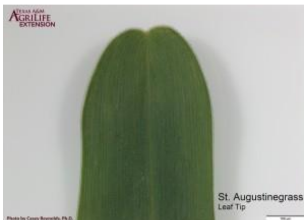
St. Augustinegrass Leaf Tip