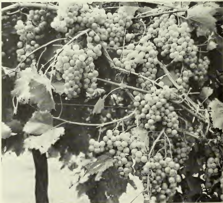
Figure 3. Heavy fruiting of a six-year-old 'MissBlanc' grapevine in the research vineyard of the Truck Crops Branch Station at Crystal Springs, Mississippi on August 7, 1979.