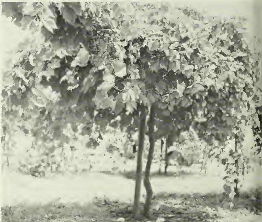
Figure 2. A vigorous, eight-year-old vine of 'MissBlanc' bunch grapes at the Truck Crops Branch Station at Crystal Springs in August 1981. This vine produced 60 pounds of grapes in 1981.

MissBlanc has perfect flowers and should be fully self-fertile, but has not been grown under isolated conditions by MAFES personnel. The berries are white to green in color. Clusters are shown on the front and in Figure 3.