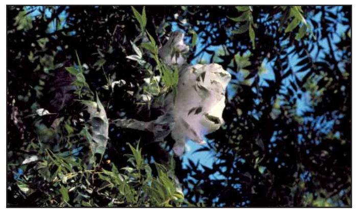
Tightly woven fall webworm web.

The feeding preferences of fall webworms vary from one place to another. In west Texas, mulberry, poplar and willow are preferred; oak, hickory and pecan are most often attacked in east Texas.