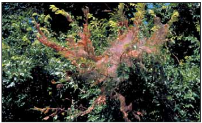
Loosely woven web.

Larvae of the orange race have orange heads and orange tubercles, while larvae of the black race have black heads and tubercles.