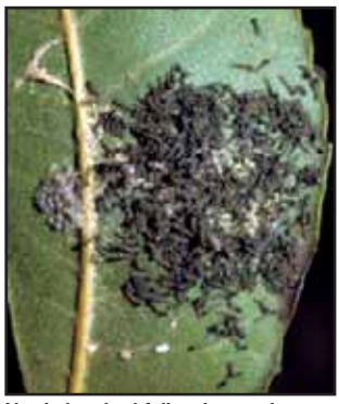
Newly hatched fall webworm larvae.

spinosad (Spintor<sup>®</sup>), and methoxyfenozide (Intrepid<sup>®</sup> 2F) are effective. Insecticides containing Bt , tebufenozide and spinosad are selective for caterpillars and do not harm beneficial insects; however, they must be applied when caterpillars are small for effective control.