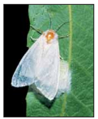
Adult laying eggs.

The larvae begin to build a silk web soon after hatching. As larvae consume leaves within the web, they expand the web to take in more foliage. All larvae within a web are the offspring of a single egg mass. Larvae will molt six or seven times before leaving the web to pupate. The life cycle from egg to adult requires approximately 50 days under ideal conditions.