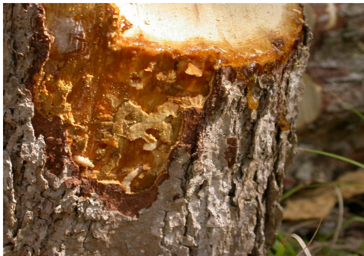
Soapberry larvae and sapwood damage

While the Western Soapberry is not highly valued as a landscape tree, it is a Texas native and a food source for birds and butterflies.