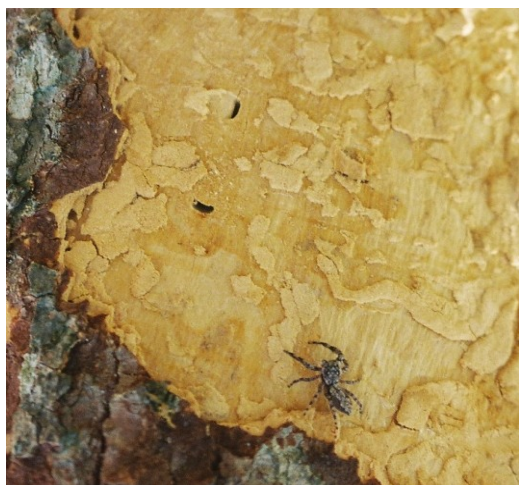
Older damage and D-shaped exit holes

Newly developed beetles emerge from the sapwood leaving a D-shaped (sort of) exit hole. The beetle is not known to attack other species, and soapberries less than 2 inches in diameter at a height of 4.5 feet above the ground are rarely attacked.