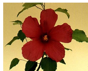
Texas Hibiscus SuperStar