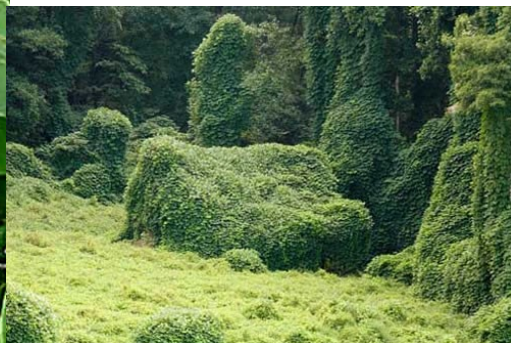
Kudzu engulfing an abandoned house in center of pic; All vegetation covered and killed by Kudzu