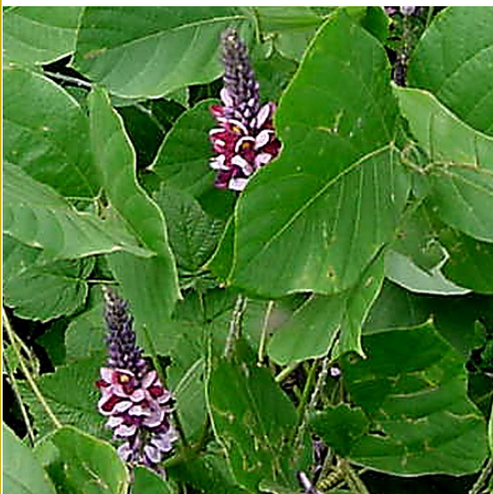
Flowers and Foliage

If you want to see kudzu in bloom for yourself, take SH 35 north toward Alvin. At CR 192 (the main intersection south of Camp Mohawk with the yellow blinking light and Diamond Shamrock gas station), turn left. Go about 0.1 miles to the first unpaved driveway on the left. The bar ditch along that road is loaded with the escaped kudzu.