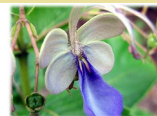
Blue Butterfly Clerodendrum