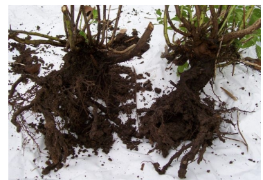
Divided Salvias (above) and Dianella (below) waiting for pots