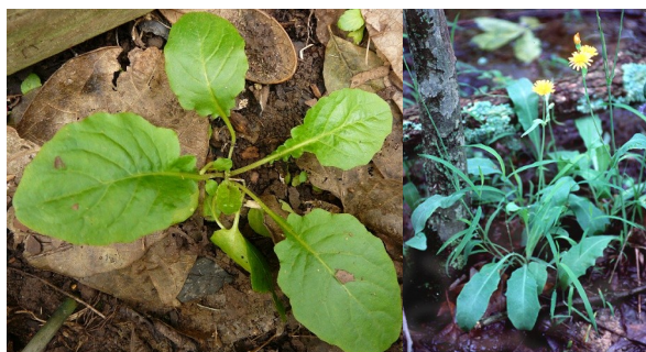
False Dandelion Young plant on left. Mature on right. There are several plants called "false dandelion" in this area. They all look rather like leaf lettuce when young. And they're prolific.

Does anyone not recognize clover? As a perennial, the whole plant needs to come out, or it will continue to grow. Long rhizomes hold the plant tenaciously in the soil. The better the soil, the deeper the roots. Get it while it's young.