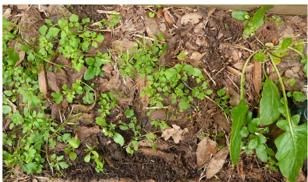
Why mulch? Here's graphic proof...these appeared within the last week in an unmulched area. There are 7 different weeds in 1 sq. ft.!

The following represent just a few of the non-native winter weeds we're likely to see. For a rogue's gallery of many different weeds and their growing seasons, see http://scsphotogallery.tamu.edu/gallery/JimMcAfeeWeeds?page=1