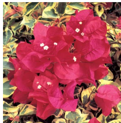
'Raspberry Ice' Bougainvillea Variegated leaves too — over-the-top color

Nothing bothered the bamboo varieties except maybe those of us who had to whack it back to keep it from covering everything. Thanks to all who helped in this endeavor. It is possible that the addition of edging and mulching all the beds made the gardens look so much better that people didn't notice the unhappy plants as much!