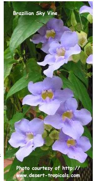
Brazilian Sky Vine

Whew...all the tropicals that had a tough winter, some killing back to the ground, did return with mild weather. Even the plumerias made it. Then, of course, some plants suffered from the prolonged tropical heat, and some plants suffered from the absent tropical rainfall. All in all, though, the gardens had something to display throughout the summer. The 'Raspberry Ice' Bougainvillea never stopped blooming and remains in a battle with the Brazilian Sky Flower ( Thunbergia grandiflora ) as to which can put out the longest 'arms'. However, the Purple Allamanda Vine, also known as Rubber Vine ( Cryptostegia grandiflora ) has them both beat. The plumbagos, durantas, and bauhinias had to be cut back to keep them in bounds. The crinum were more dependable than the cannas. The Crown of Thorns varieties we have didn't mind the dryness, so they bloomed sporadically.