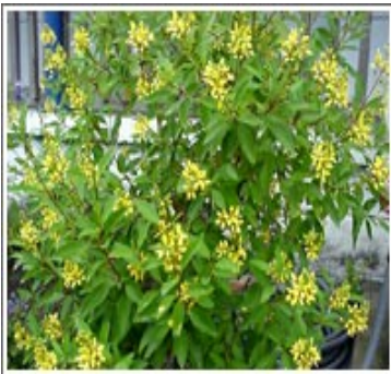
See a nice thryallis specimen at BEES in front of the greenhouse