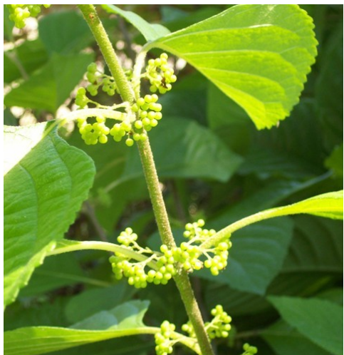
American Beautyberry ( Callicarpus americana )

Now, not only are the requirements a bit more stringent, but there are two different certification plans. One kind is the Texas Wildscape , same name but slightly different rules. Barbara's garden, even certified under the old rules, does seem to conform to this plan quite well. The second kind of official habitat garden is the Best of Texas Backyard Habitat , which uses only native plants, and attempts to reconstruct a sort of mini-refuge for both animals and plants, conserving the sort of habitat that was here before we were.