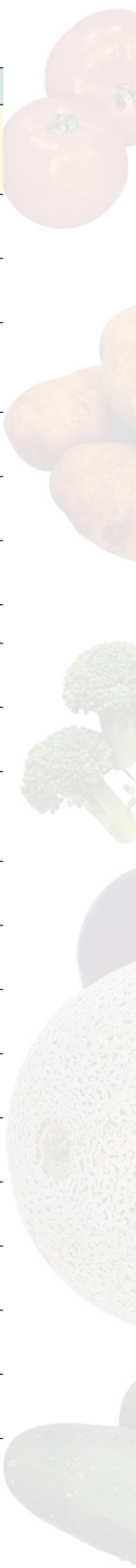
Table 8. Vegetable planting continued.