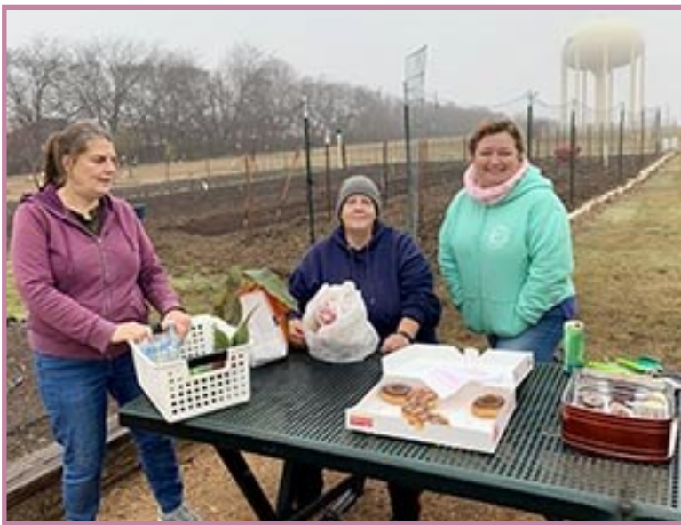
Interns Class of 2022

For the week, 55.5 lbs Carrots, Turnips, Broccoli and Beets were harvested. This completed the harvest of turnips, broccoli and beets. Expended plants were removed. 8 January was a cool, foggy day. Fourteen Master Gardeners were present including three 2022 interns. Bio-soil was added to the garden to prepare soil when seed potatoes are available. General Maintenance; watering, weeding and trimming were also accomplished.