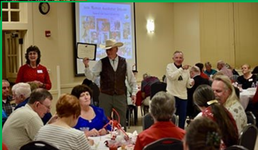
Auction items going under the hammer