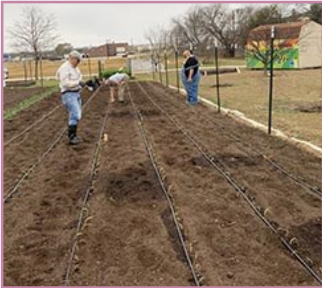
Dave Slaughter and Ed Eayala planting onions .

Big crew of gardeners on the final workday of 2021. Six rows of yellow, red and white onions planted ( a big thankyou to Bill Walker for providing all the onion slips); 100lbs of tomato's harvested, expended tomato and pepper plants cleared, and the entire garden watered. A great conclusion to KMCCG 2021.