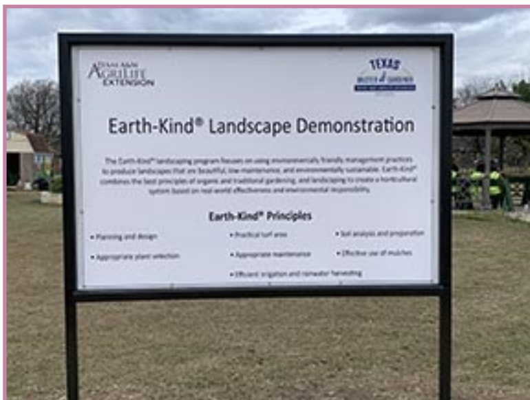
New sign installed at the garden entrance.