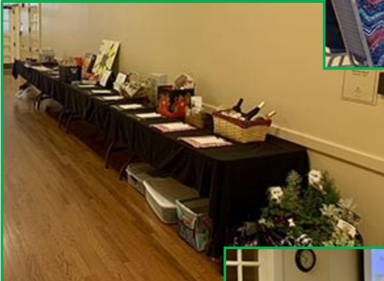
Auction items on display