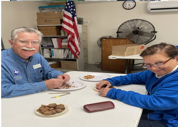
Working alongside our Williamson County MG friends