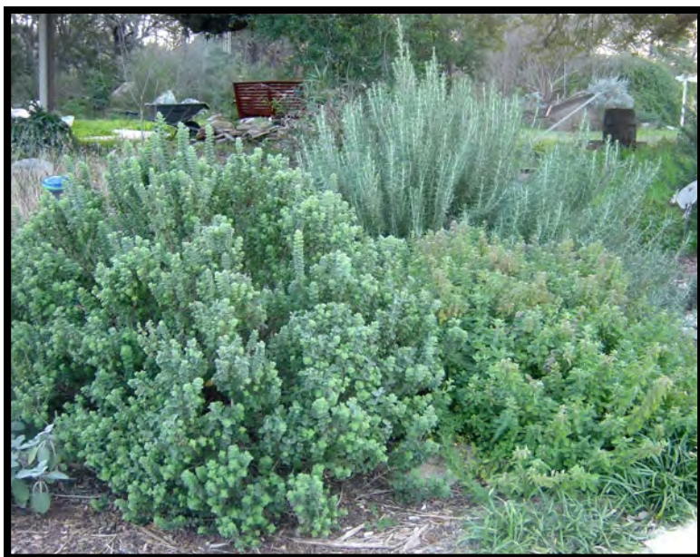
Oreganos and Rosemary

The Herbal Forum this year unfortunately coincides with our Plant Sale, but for those of you not working the plant sale and if you're interested in herbs, the Herbal Forum may be just the thing for you! "The Fruitful Herbal Harvest" celebrating Elderberry, Herb of the Year 2013 is at Festival Hill in Round Top on March 22 and 23 . The website is festivalhill.org . Click on Events. Several MG's usually attend this conference - many of us get rooms together. Contact me if you have any questions or are interested.