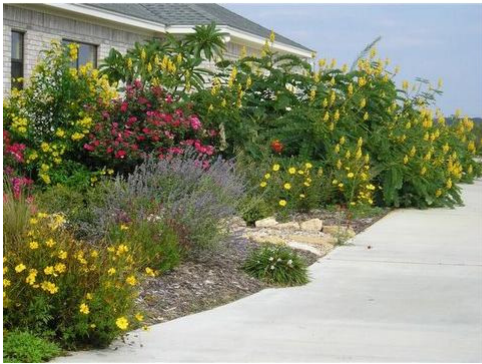
Betty Lowe Garden

While you are in Salado visit Green Bridge Park. The iron truss bridge dates back to 1889 and has Troll and Billy Goat Gruff sculpture by Salado artist Troy Kelley. This garden is located on Main Street and is planted with native trees and perennials.