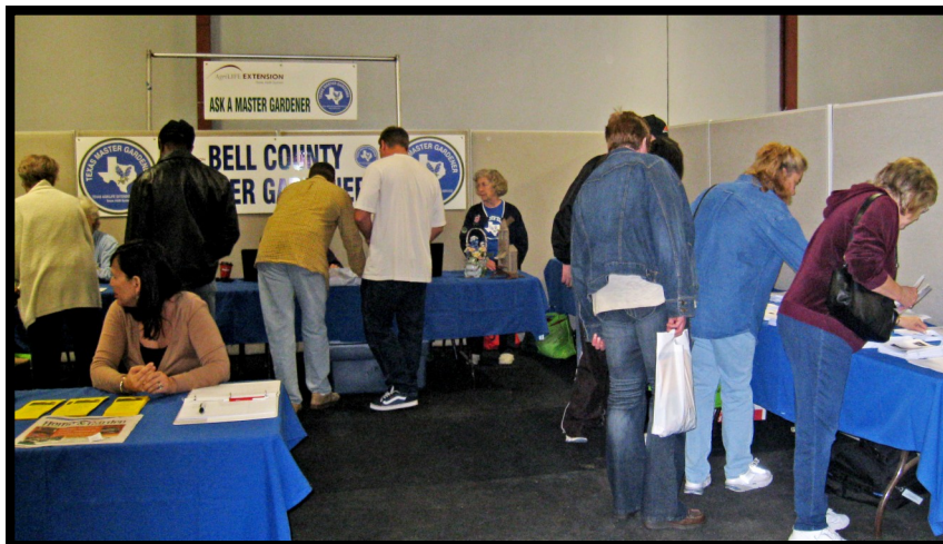
This photo and the photo on the next page are from the Home and Garden Show.