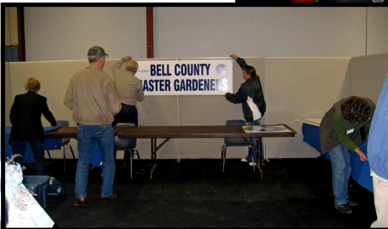
BCMG's putting together their booth for the Bell County Home and Garden Show at the Expo Center. Below, a seminar on Culinary Herbs is presented and MG's answer questions at the "Ask a Master Gardener" booth.