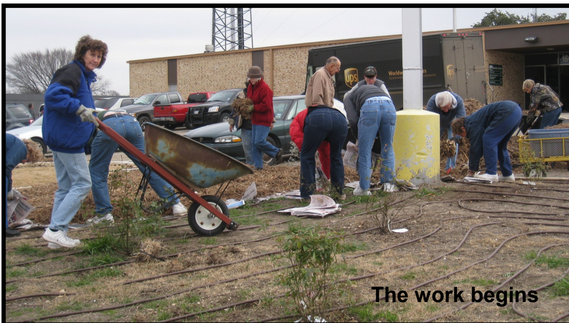
The work begins