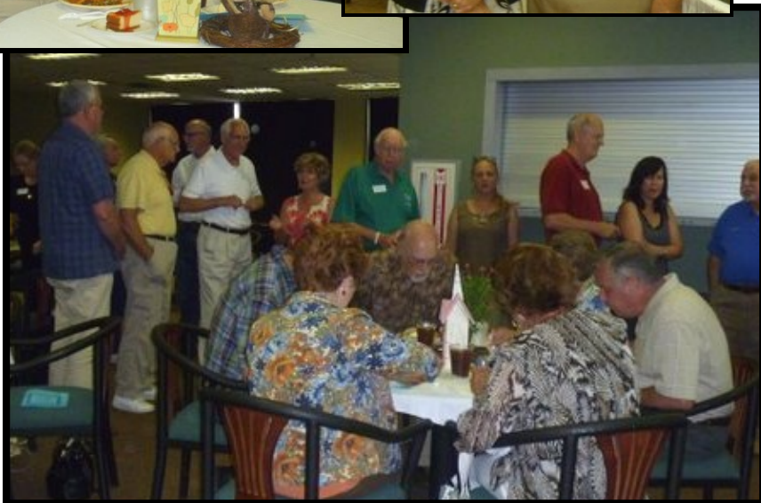
Graduation