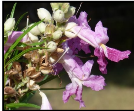
Cover Photo by Mary Lew Quesinberry: Lots of blooms for the Hummingbirds on the "Bubba" Desert Willow in the Quesinberry yard.