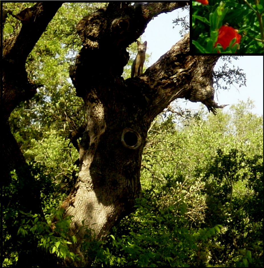
- Werner and Terrie Hahn

A young fox in one of our Oak Trees about 15 feet up. Two of them had been investigating a hole further down in the tree.