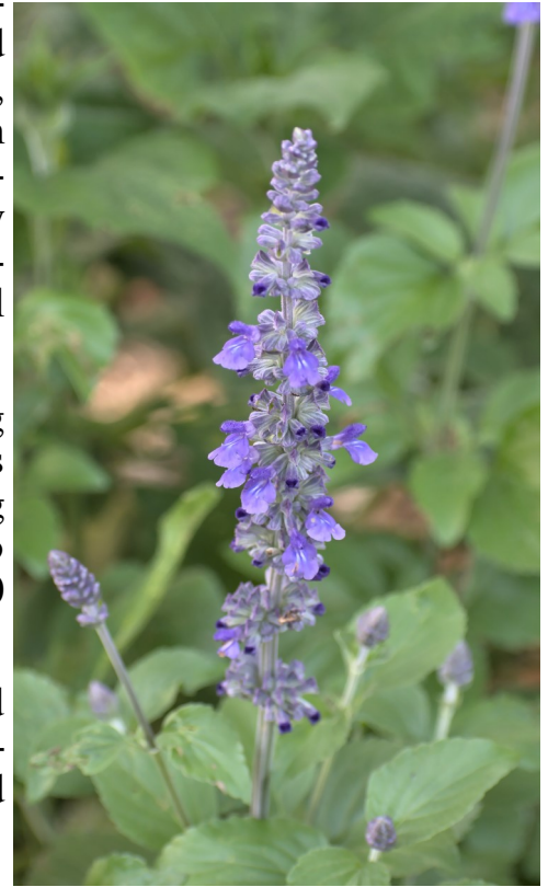
Flowers much-loved by pollinators.

On the left is an attempt to group Mystic Spires to create a larger focal point. In 2022, I planted three #2 plants around the previous year's single plant on the other side of the walkway, following "expert" guidelines and planting on 2-foot centers. The established plant crowded them out, forcing them to lean away to gain sun exposure. This year, the only one still alive was farthest from the original plant.