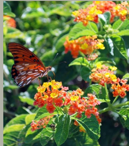
Gulf Fritillary on Lantana