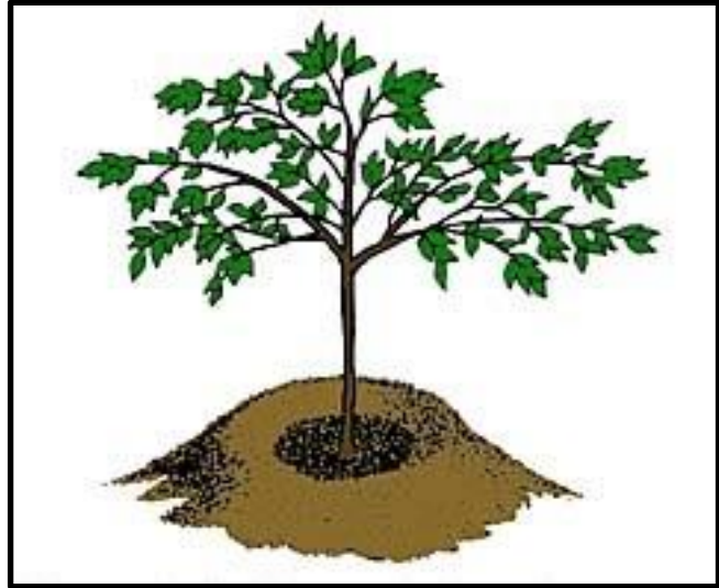
Figure 2. Build a watering ring slightly wider than the planting hole.

Mixing topsoil, compost, peat or other materials with the backfill soil is unnecessary in good citrus soils. Set the tree in the hole, backfill about halfway, then water sufficiently to wet the backfill and settle it around the roots. Finish filling the hole and tamp the soil lightly into place. Cover the root ball with 1/2 to 1 inch of soil to seal the growing medium from direct contact with the air and prevent rapid drying of the root ball.