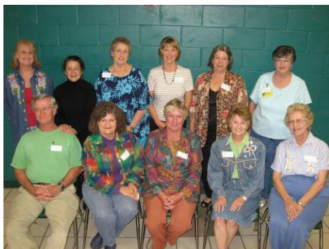
MG Award winners in attendance for incremental hours