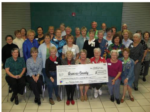
All MG's recertified, in attendance.